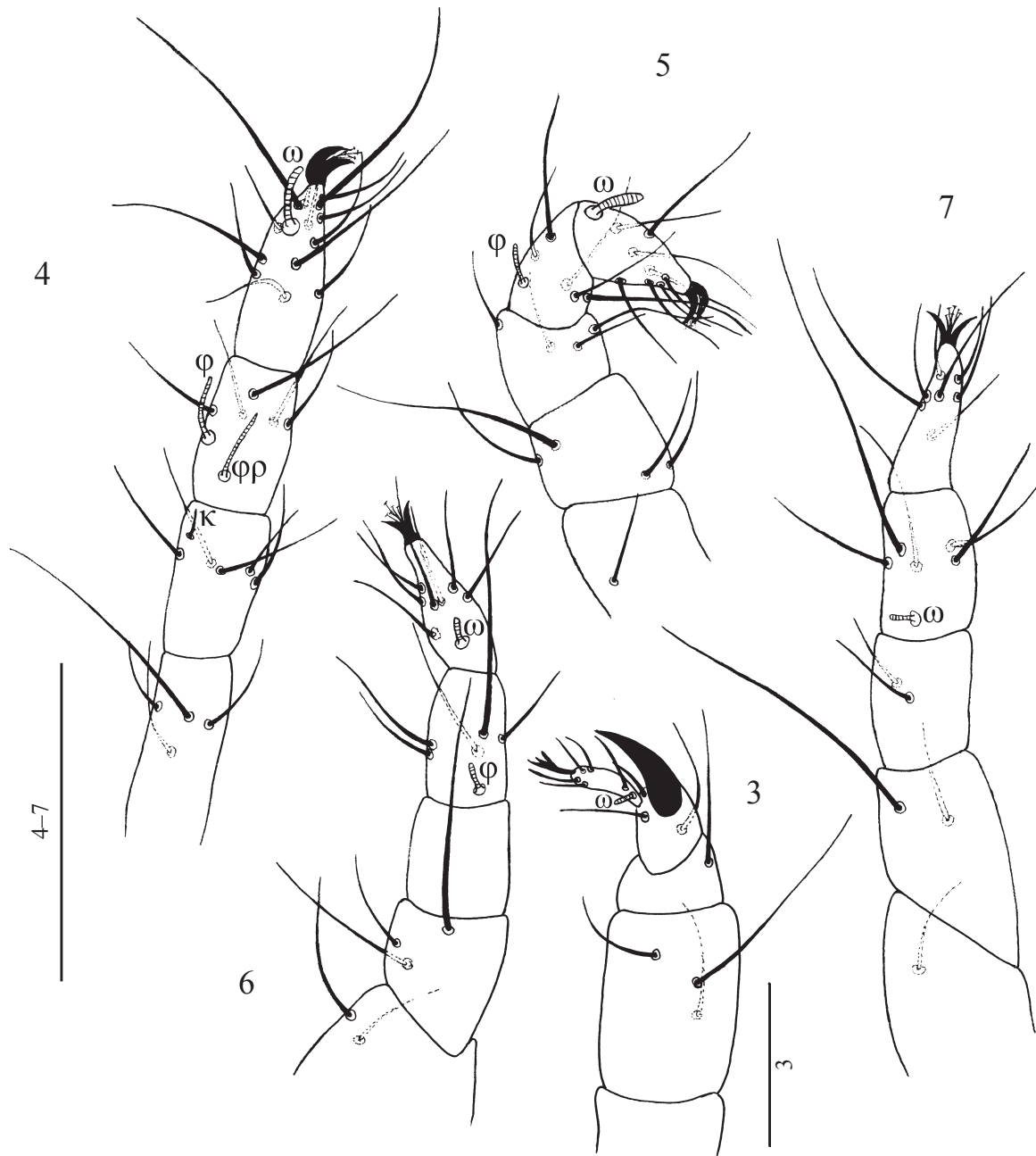
Figs 3–7. Stigmaeus iranensis sp. n., female. 3 — dorsal view of palp, 4–7 — legs I–IV, respectively in dorsal view. Scale bars: 3 = 25 \mu m, 4–7 = 50 \mu m.

(3) genua I–IV are with 6–4–0–2 vs. 6–4–1–2 in S. marandiensis ; (4) tarsi IV are without solenidion vs. with solenidion in S. marandiensis . The new species is also close to S. planus Kuznetsov, 1978 in the shape of the dorsal shields but can be separated by following characters: (1) the prodorsal shield is completely smooth vs. reticulated in S. planus (Kuznetsov 1978); (2) e 2 are on the distinct small platelets vs. on integument in S. planus ; (3) ag 1– ag 4 are located on a single shield vs. ag 1– ag 2 and ag 3– ag 4 located on different shields in S. planus ; (4) genua I–IV are with 6–4–0–2 setae vs. 6–3–0–1 in S. planus .