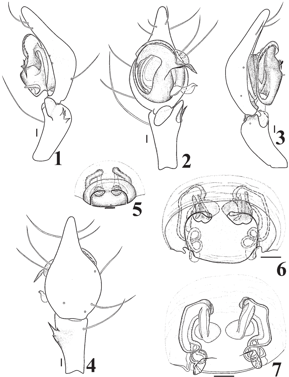
Figs 1–7. Copulatory organs of Malthonica dalmatica : 1 — male palp, retrolateral view; 2 — male palp, ventral view; 3 — male palp, prolateral view; 4 — male palp, dorsal view; 5 — epigyne, ventral view; 6 — spermatheca, ventral view; 7 — spermatheca, dorsal view.

Рис. 1–7. Копулятивные органы Malthonica dalmatica : 1 — пальпа самца, вид ретролатерально; 2 — пальпа самца, вид вентрально; 3 — пальпа самца, вид пролатерально; 4 — пальпа самца, вид дорсально; 5 — эпигина, вид вентрально; 6 — сперматека, вид вентрально; 7 — сперматека, вид дорсально.