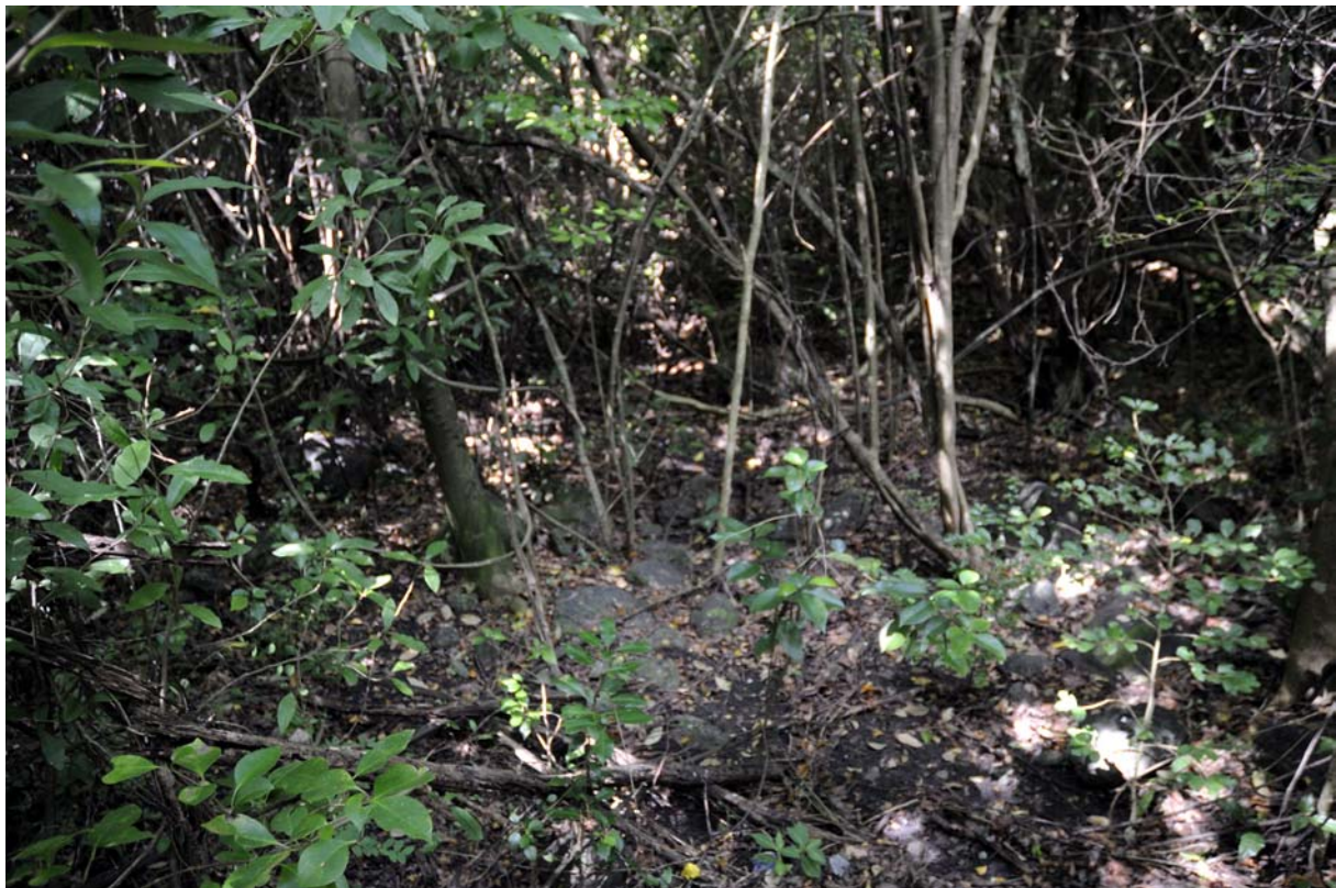
Fig. 11. The habitat composed of primary and secondary forest, whence Tityus marechali sp.n. has been taken. The stones on the ground are possible shelters for the scorpion.

Рис. 10. Tityus marechali sp.n., живой голотип в природе.