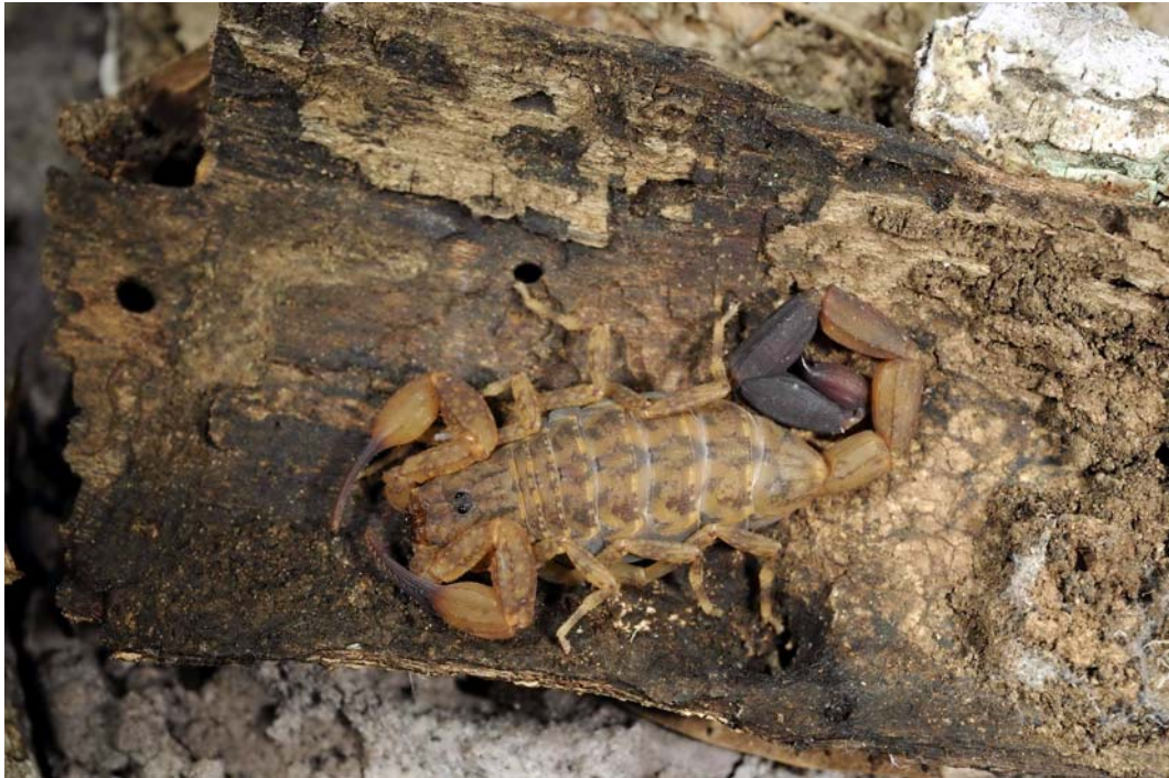
Fig. 10. Tityus marechali sp.n., holotype alive in the field.

Рис. 10. Tityus marechali sp.n., живой голотип в природе.