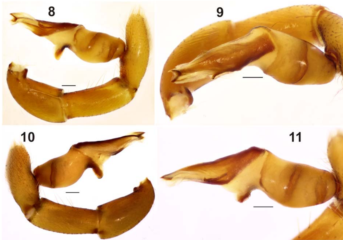
Figs. 8–11. Male palp of Dysdera cylindrica . 8, 10 — retro- and prolateral; 9 — anterior; 11 — dorso-retrolateral. Scale = 0.2 mm.

Рис. 8–11. Пальпа самца Dysdera cylindrica . 8, 10 — ретро- и пролатерально; 9 — спереди; 11 — дорзально-ретролатерально. Масштаб 0,2 мм.