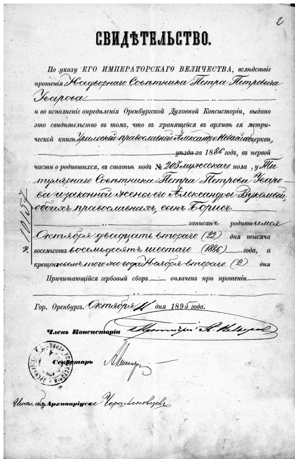
Fig. 3. Excerpt from the registry book. Archival reference: RGIA, F.398, Op.71, D.26020, L.2. Рис. 3. Выписка из метрической книги (РГИА. Ф.398. Оп.71. Д.26020. Л.2).