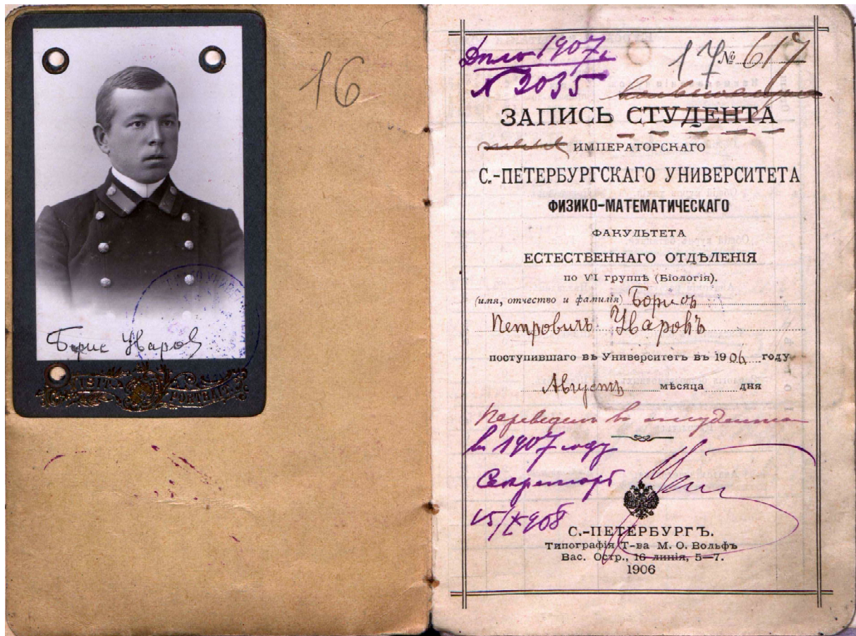
Fig. 2. Boris Uvarov's University Transcript title page. Handwritten remarks reveal his immatriculation as an external student in 1906 and change of his status to that of a student in 1907. Archival reference: TsGIA, F.14, Op.3, D.50126. Ll.16 back side — 17.

Рис. 2. Титульная страница «Записи студента имп. Санкт-Петербургского университета физико-математического факультета естественного отделения по 6-й группе (биология) Бориса Уварова» (аналог зачетной книжки). Рукописные исправления показывают, что Уваров первоначально поступил в университет вольнослушателем, а весной 1907 г. стал действительным студентом (ЦГИА. Ф.14. Д.50126. Лл.16об — 17).