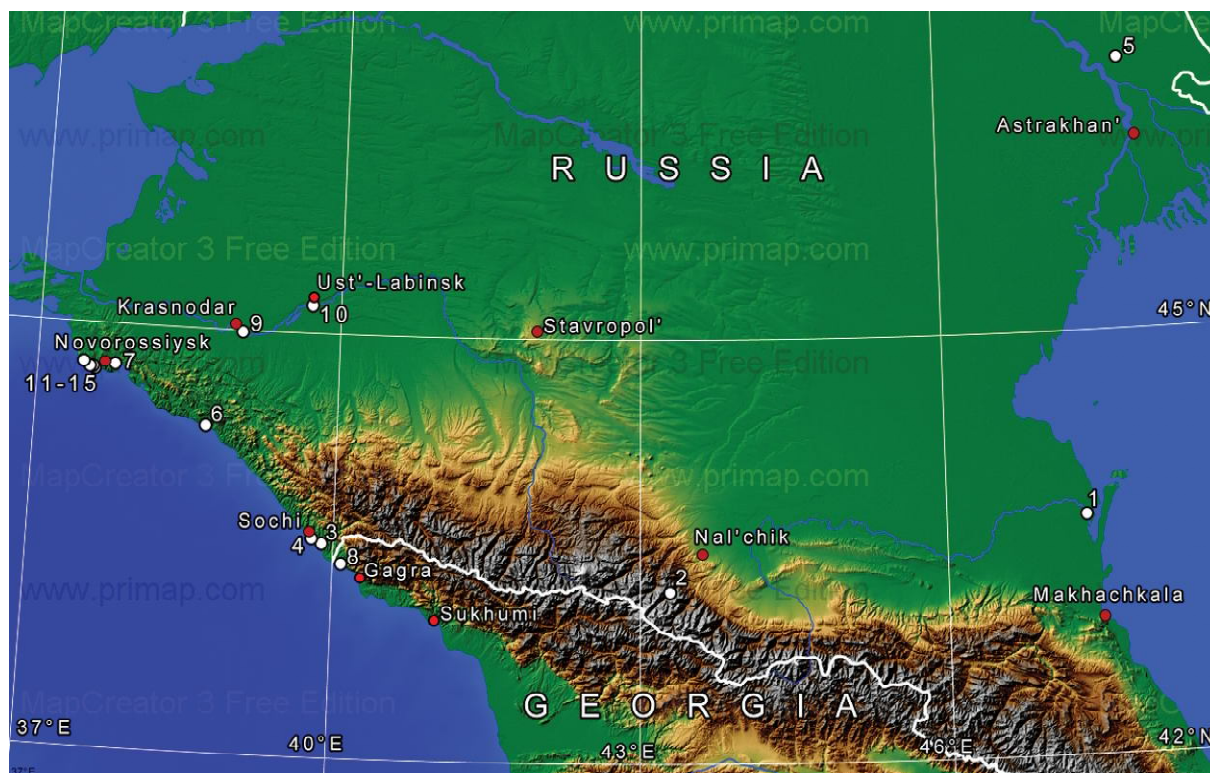
Fig. 1. Localities where Anax ephippiger was found in Russia. For explanation of locality numbers see the text.

Рис. 1. Места находок Anax ephippiger в России. Номера локалитетов соответствуют таковым в тексте.