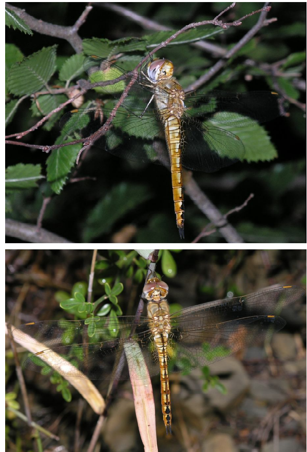
Fig. 4. Females of Pantala flavescens resting in the evening at oak-hornbeam forest margin at the Sukhaya Shchel' Valley 2.3 km W of of Dyurso village, 20.VII.2017.

The mass appearance of A. ephippiger observed in Abrau Peninsula is most interesting. No doubt, so numerous individuals arrived to Abrau Peninsula from behind the Caucasus in the north, as following the strong storm. It is known that in tropics, «migrating swarms travel with rain bearing winds (seasonal monsoon fronts), which allow the species to use temporary flooded depressions to breed» [Corbet, 1999; Günter, 2005; Kalkman, Monnerat, 2015: 171]. The same is known for another migratory species, P. flavescens . Symptomatically, it was also observed along with A. ephippiger in Abrau Peninsula, although much fewer in num-