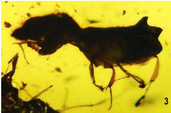
Figs 2–3. Habitus of Poinarinius coziki Háva et Legalov sp.n. 2 — holotype, 3 — paratype.