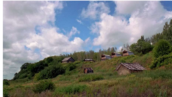
Fig. 2. Beechi cordon (T1). Рис. 2. Кордон Бичи (Т1).

The annotated check-list of wasp species (Hymenoptera, Vespomorpha) of the Komsomolsky State Nature