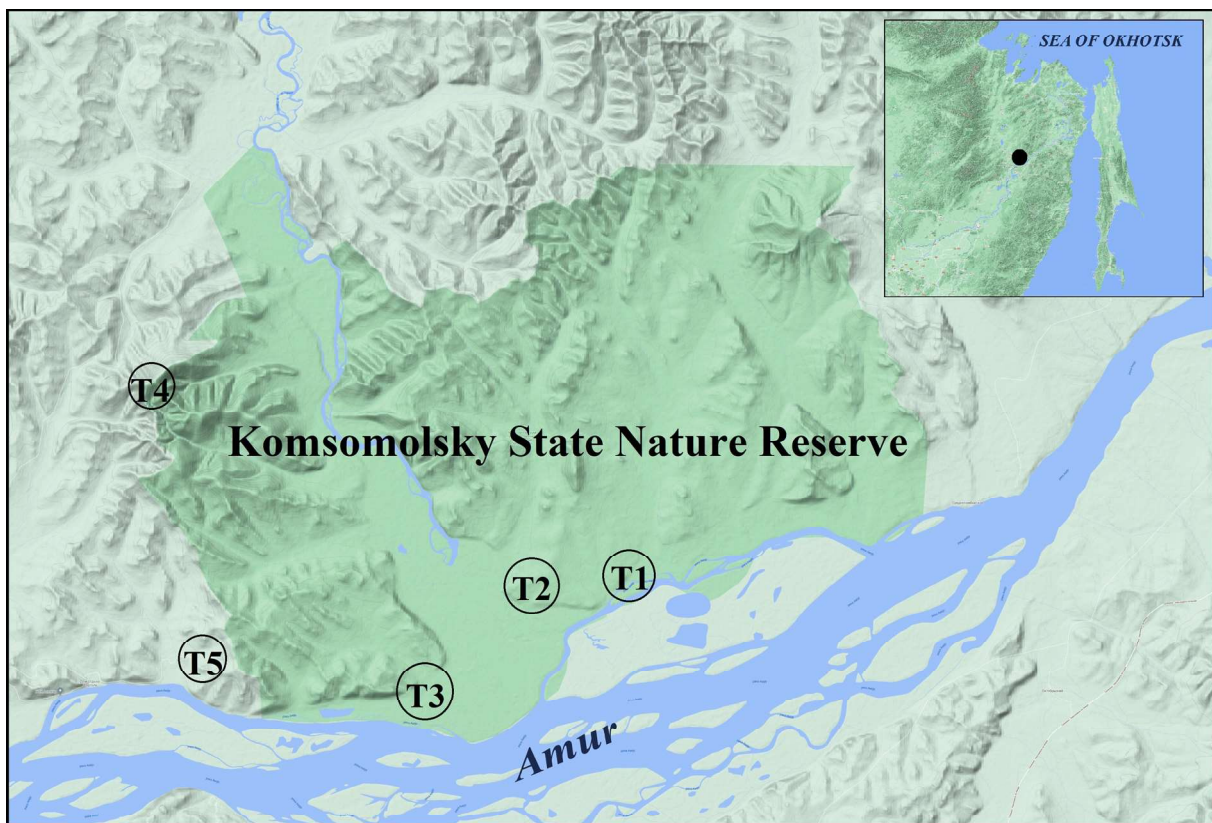
Fig. 1. T1–T5 locality map of wasps in the Komsomolsky State Nature Reserve. The map was obtained from the site https://nakarte.me/ .

Рис. 1. Карта-схема Комсомольского заповедника. T1–T5 — точки сбора ос. Карта получена с сайта https://nakarte.me/ .