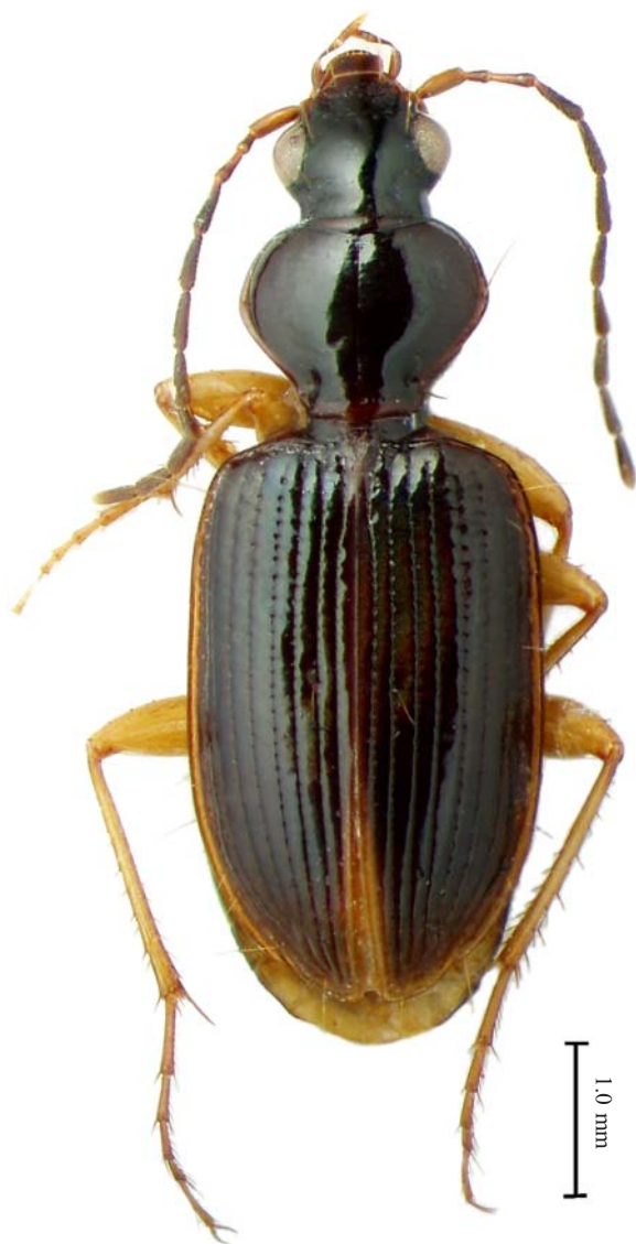
Fig. 1. Stolonis charrua Anichtchenko, sp.n. , holotype. Рис. 1. Stolonis charrua Anichtchenko, sp.n. , голотип.

pronotum. Lateral margins broadly rounded and explanate medially, narrowed apically and basally, maximal width near anterior pore. Base and basal impressions impunctate. Hind angle obtuse and rounded at apex. Basal submarginal sulcus narrow and complete.