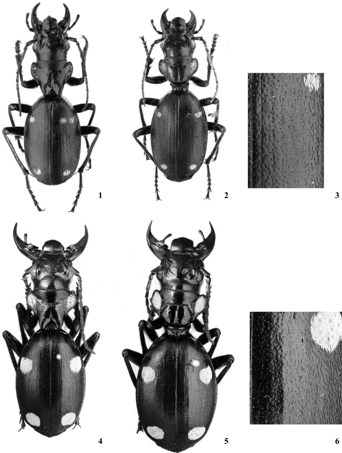
Figs 1–6. Anthia mannerheimi , habitus: 1–3 — A. m. afghana ssp.n.; 4–6 — A. m. mannerheimi ; 1, 4 — males; 2, 5 — females; 3, 6 — elytral sculpture; 1 — holotype; 2 — paratype.

Рис. 1–6. Anthia mannerheimi , внешний вид: 1–3 — A. m. afghana ssp.n.; 4–6 — A. m. mannerheimi ; 1, 4 — самцы; 2, 5 — самки; 3, 6 — скульптура надкрылья; 1 — голотип; 2 — паратип.