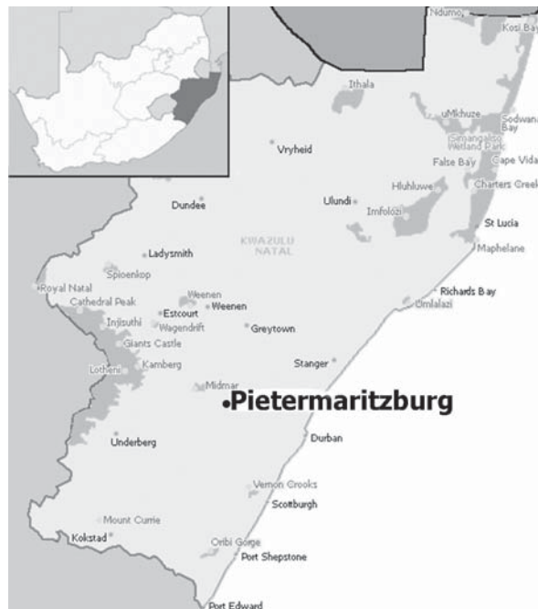
Fig. 1. Prov. KwaZulu-Natal in South Africa Republic. Рис. 1. Карта провинции Квазу́лу-Ната́л (ЮАР).

MATERIAL. S. Africa, KwaZulu-Natal, Pietermaritzburg, Hilton, Malaise trap, 23.109–12.11.2003, leg. M. Mostovski (49 spec.); ibid. 13–23.11.2003, leg. M. Mostovski (25 spec.); ibid. 24.11–09.12.2003, leg. M. Mostovski (52 spec.); ibid. 109–23.12.2003, leg. M. Mostovski (24 spec.); ibid. 24.12.2003–14.01.2004, leg. M. Mostovski (31 spec.); ibid. 15–26.01.2004, leg. M. Mostovski (6 spec.); ibid. 27.01–16.02.2004, leg. M. Mostovski (47 spec.); ibid. 17–29.02.2004, leg. M. Mostovski (18 spec.); ibid. 29.02–13.03.2004, leg. M. Mostovski (34 spec.); ibid. 3–5.03.2004, leg. M. Mostovski (3 spec.); S. Afr., KZN, PMB, Hilton, Malaise-tr./ garden, 27.09–13.10.2003, leg. M. Mostovski (79 spec.).