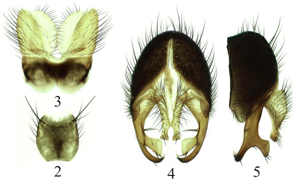
Figs 1–5. Cordilura pulchra sp.n., ♂: 1 — adult; 2 — sternite 4; 3 — sternite 5; 4 — epandrium, cerci and surstyli, dorsal view; 5 — epandrium, cerci and surstyli, lateral view.

Рис. 1–5. Cordilura pulchra sp.n., ♂: 1 — имаго; 2 — стернит 4; 3 — стернит 5; 4 — эпандрий, церки и сурстили, сверху; 5 — эпандрий, церки и сурстили, сбоку.