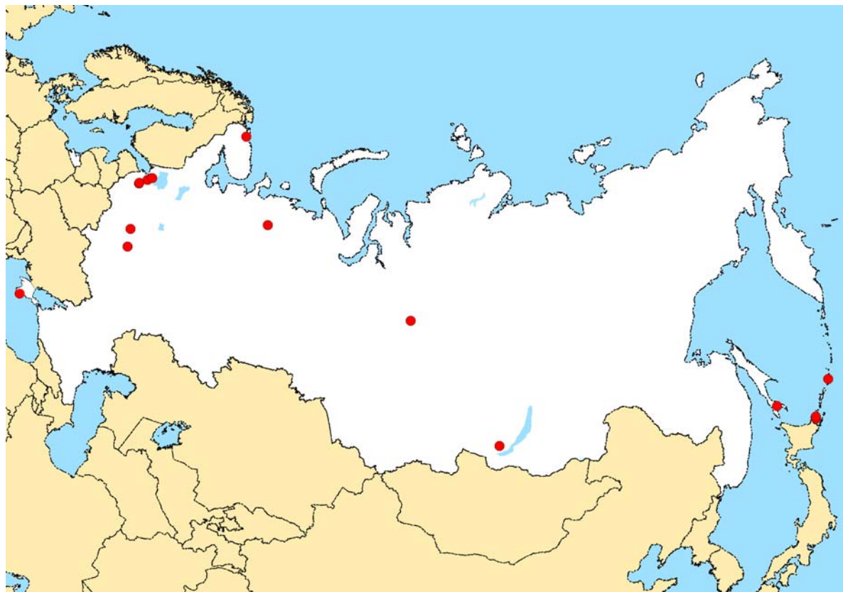
Fig. 11. Map of distribution of Euleia heraclei (Linnaeus, 1758) in Russia.

Рис. 11. Карта распространения Euleia heraclei (Linnaeus, 1758) в России.