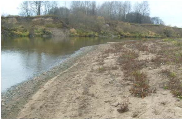
Fig. 9. Type locality of Thinobius semenovi sp.n.: Smolensk, Krasny Bor, the sandy bank of the Dnieper River.

Рис. 9. Типовое местонахождение Thinobius semenovi sp.n.: Смоленск, Красный Бор, песчаный берег р. Днепр.