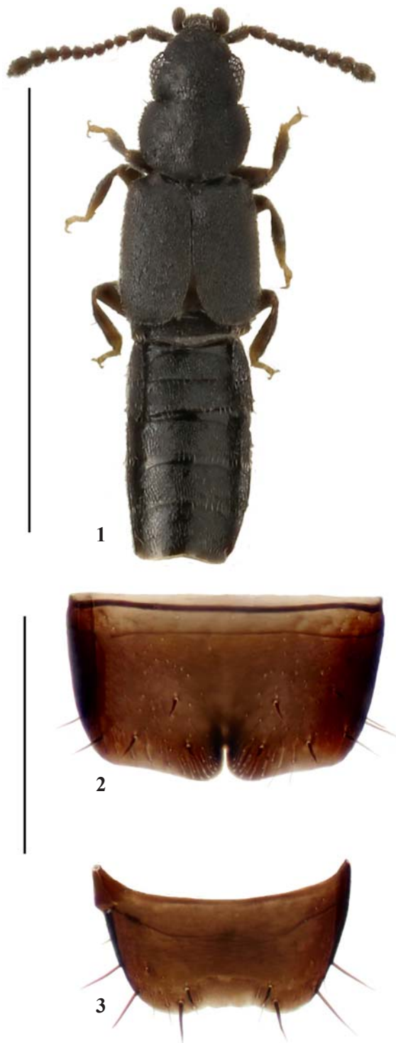
Figs. 1–3. Thinobius semenovi Semionenkov, sp.n. ♂ paratype: 1 — habitus, dorsal view; 2–3 — sternites VIII and IX. Scale bars: 1.0 mm (1), 0.2 (2–3) mm.

Scutellum is of a triangular shape, covered by fine and dense punctation. Elytra (Fig. 1) are parallel-sided, weakly dilating posteriorly and almost twice more longer than pronotum (PL:SL — approximately 0.6:1). Length and width of elytra are approximately equal (approximate relation of length to width: 1.05:1). Humeral angles are well expressed, round-