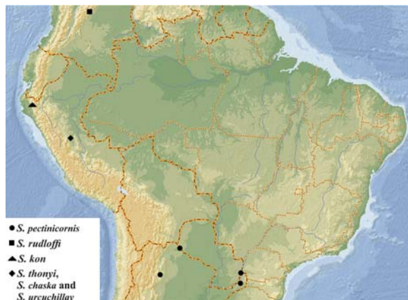
Fig. 13. Distribution map of Schreiteriana Fletcher et Nye, 1982. Рис. 13. Карта распространения видов Schreiteriana Fletcher et Nye, 1982.

With the newly described above species, Schreiteriana is represented by six species, relatively widespread in Argentine, Peru, and Columbia (Fig. 13). The differences in male genital