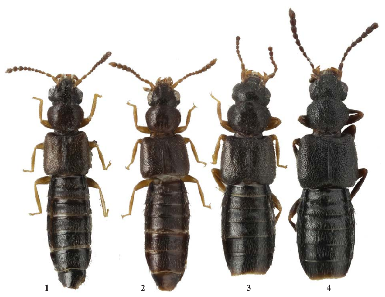
Figs 1–4. Carpelimus ( Trogophloeus ) spp., holotypes, males, dorsal view: 1 — C. notumus , sp.n. ; 2 — C. vilisus , sp.n. ; 3 — C. plenus , sp.n. ; 4 — C. notatus , sp.n.

ETYMOLOGY. From Latin "notum" (known, familiar); the name alludes to the fact that the description of this species was already considered, for instance, by Max Bernhauer.