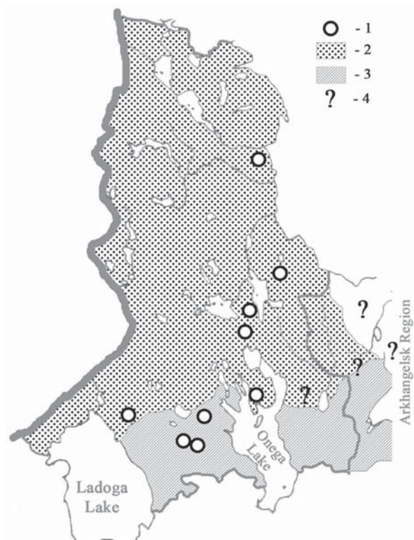
Fig. 2. Present-day distribution of beavers in Karelia and partly in Arkhangelsk Province: 1 — the release sites of C. canadensis , 2 — territory occupied by C. canadensis , 3 — territory occupied by C. fiber , 4 — no information.

It is impossible to confirm what is happening in the north-eastern limit of the North American beaver distribution in Russia. North American beavers penetrated to the Arkhangelsk Province in the early 2000s and rather quickly dispersed to habitats occupied by Eurasian bea-