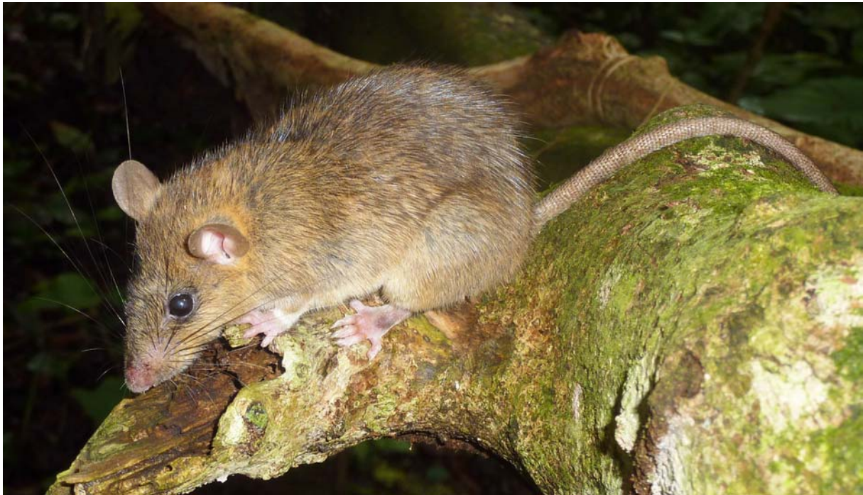
Fig. 6. Indomalayan niviventer Niviventer huang .