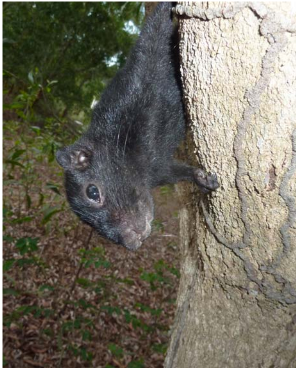
Fig. 7. Finlayson's squirrel Callosciurus finlaysonii .

central part of the country (Dang Ngoc Can et al. , 2008). The species identification of mainland records needs to be confirmed.