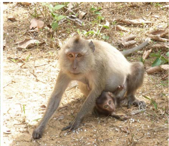
Fig. 8. Crab-eating macaque Macaca fascicularis in So Ray Plantation.