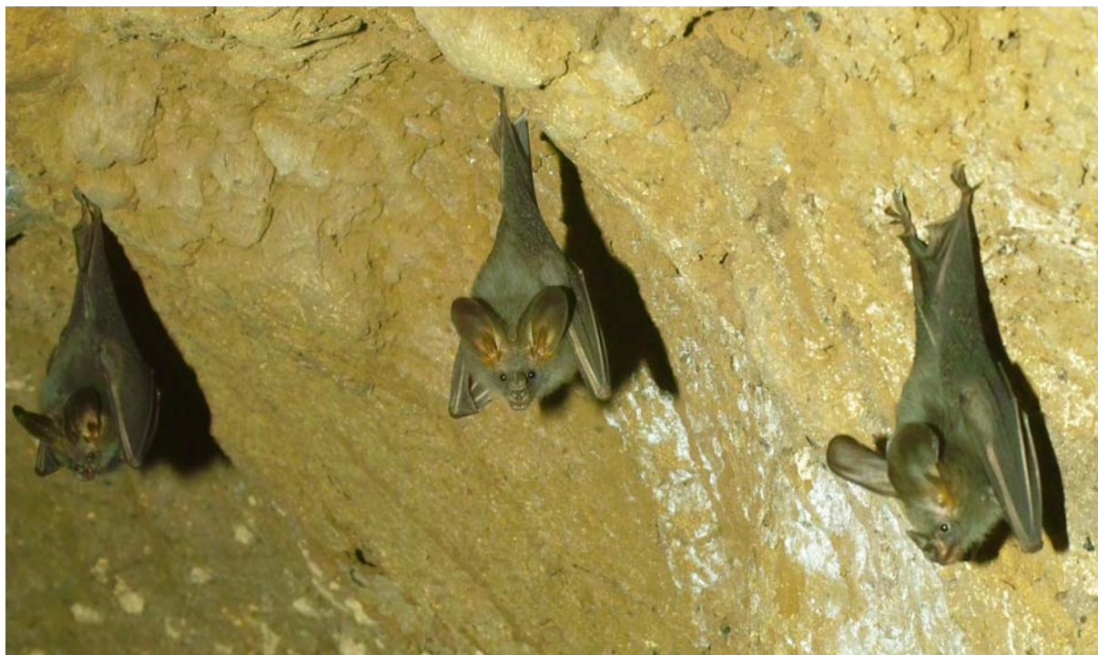
Fig. 4. Lesser false vampire bats Megaderma spasma roosting in the cavity.

Taxonomic remarks. The measured males had the forearm length of around 53.6 mm — close to the lower limit of size variation in the Vietnamese M. spasma . There is a possibility that this presumably sedentary bat may form a separated race in Con Dao. Unfortunately we failed to extract DNA from Con Son Megaderma specimens that would suffice for an analysis, and therefore cannot comment on their intraspecific relations.