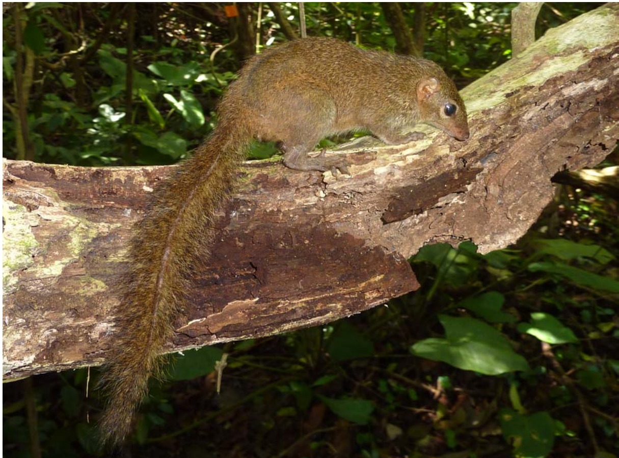
Fig. 2. Northern tree-shrew Tupaia belangeri .

Despite considerable trapping efforts (more than 1200 pitfall trap-days, see Table 1), we collected only one specimen of this species. An adult female was trapped in the vicinity of Nui Chua Mt. (at 205 m a.s.l.). This is large and long-tailed shrew (head and body length 90 mm, tail length 71 mm). The mtDNA analysis suggests that the specimen from the Con Son Island belongs to C. fuliginosa (Abramov et al. , 2012).