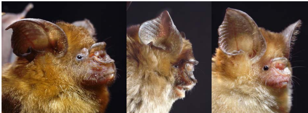
Fig. 3. Three round-leaf bats occurring on the Con Son Island (left to right): intermediate, Hipposideros grandis ; fawn, H. galeritus ; and least, H. cineraceus .