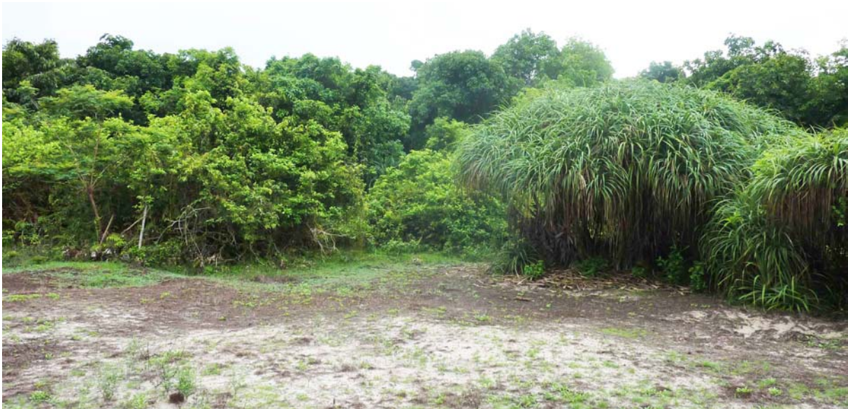
Fig. 9. Bush thickets in northern part of Con Son Island are typical habitats of Burmese hare Lepus peguensis .

Taxonomic remarks. Macaques from the Con Son Island were described as a distinct subspecies M. fascicularis condorensis Kloss, 1926.