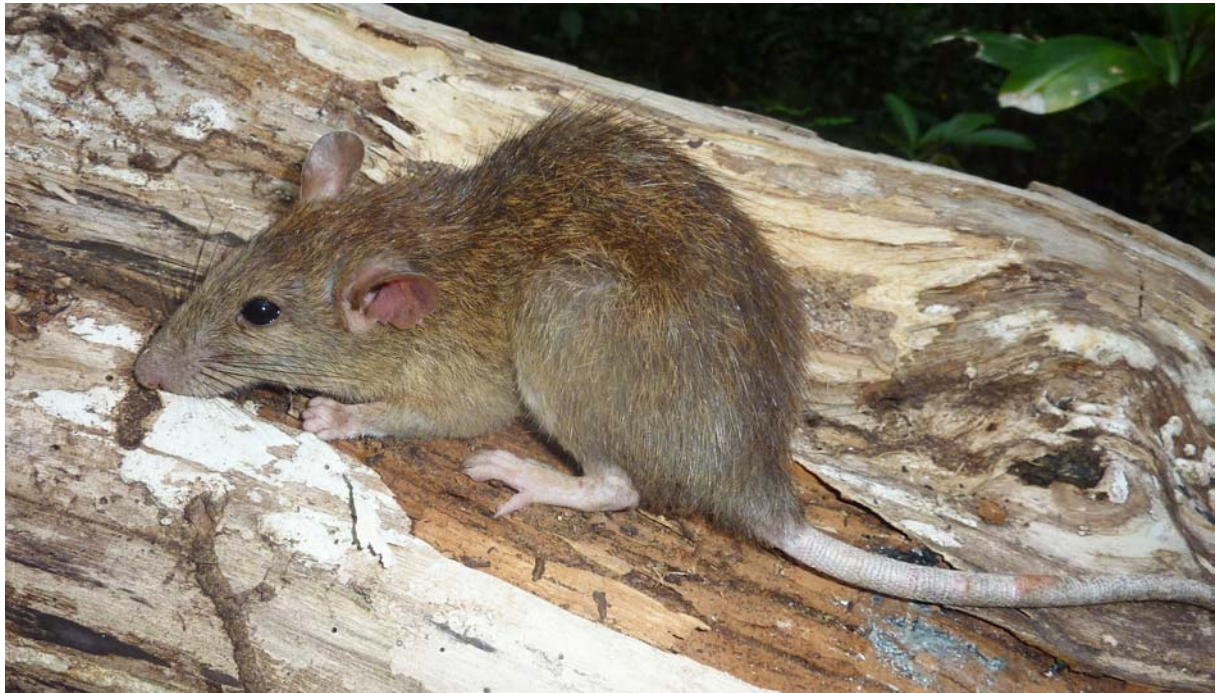
Fig. 5. Germaine rat Rattus germani .

three cryptic species was shown. According to the COI tree topology, the Con Son specimens belong to the “clade C” which is associated with K. hardwickii s. str., to which specimens from Vietnamese lowland forests also belong.