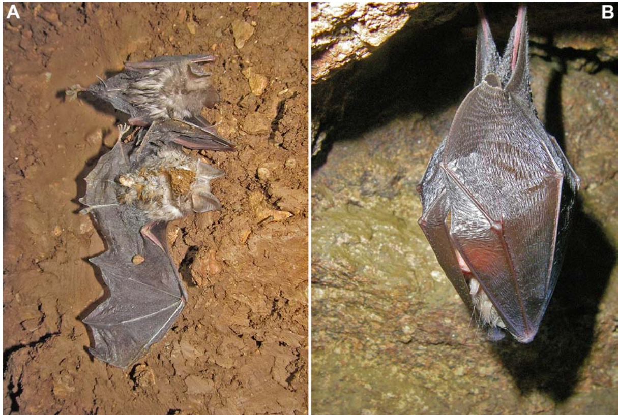
Fig. 3. Common views of the bats: A — Lesser Horseshoe bats ( R. hipposideros ) drowned in the Mamut-Tshokrak Cave; B — Great Horseshoe bat ( R. ferrumequinum ) live in the Skelskaya Cave.

It is very difficult to completely exclude the factor of disturbance. In order to implement some activities to neutralize this threat, a whole set of measures is required. It is necessary to conduct explanatory work among speleologists and diggers about the rules of behaviour in caves where horseshoe and other species of bats live. It is important to normalize visiting excursion caves, while in individual caves, which are the most important for horseshoe bats, we recommend to limit the penetration of visitors by installing an iron antivandal grille at the entrance. In addition, it is necessary to limit the dissemination of information on the exact location of the entrance to caves inhabited by Horseshoe bat colonies.