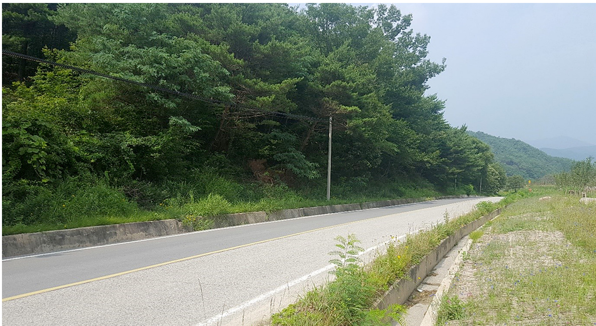
Fig. 2. Likely crossing point between Deokyu and Jiri Mountains. The two-lane road at this locality is the narrowest and least frequently used boundary of the Jiri Mountain National Park (35.5269° N; 127.6284° E). This photo illustrates the type of habitat with a weak resistance to the dispersion of U. thibetanus .

Once found after the first dispersal event, the individual was caught by SRTI rangers, identified through genetic analysis, and re-released within its last known home range on 6 July 2017. The bear was then refitted with a radio tag and kept under constant monitoring. Following its release, it circled the Jiri Mountain National Park clockwise and dispersed a second time. The exact pathway for the second dispersal event is known (Fig. 1) and the SRTI assumes that it was the same one as the one used for the first dispersal event. The focal individual crossed through the “Asiatic Black Bear Eco-corridor.” Until recently, the matrix between Jiri Mountain and Deokyu Mountain was disconnected by a motorway. The matrix was renovated two years ago, and the motorway now frequently runs under tunnels and wildlife underpasses. There is one specific section between the two mountains where the only remaining barrier is a rarely-used two-lane road, bordered by trees on one side and low vegetation on the other (Fig. 2). The young male U. thibetanus crossed between the two