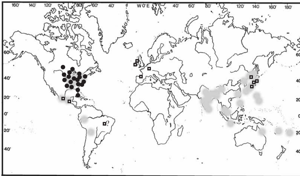
Fig. 7. Distribution of Ephemereum spinulosum . Solid circles indicate region where it was known before 1975, open squares denote records after 1975. Locality in Brasil is inexact. Shaded is distribution of Fissidens hyalinus (generalized from Ignatov et al. , 2007).

Moss Flora of China (Li X.-J. et al. , 2003) and Checklist of Chinese mosses (Redfearn et al. , 1996).