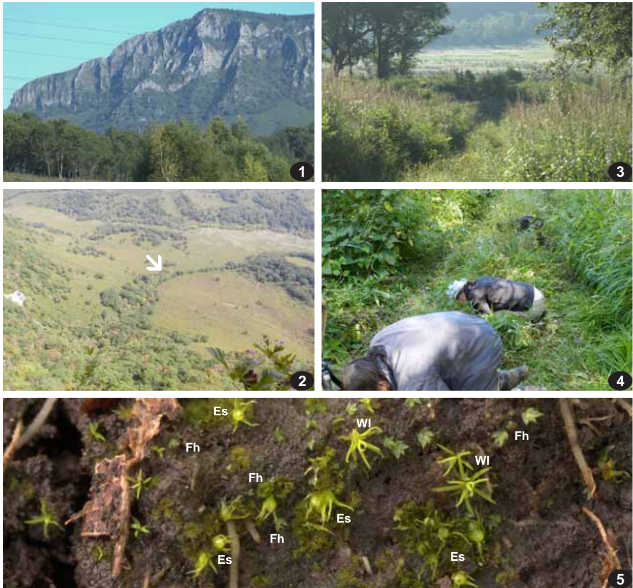
Figs. 1-5. Ephemerum spinulosum locality: 1: Lozovyj Mt. Range; 2: photo from cliff at #1 on foothill, the locality of the species arrowed; 3-4: habitat close up; 5: in situ photo by Oleg Ivanov: Es – Ephemerum spinulosum ; Fh – Fissidens hyalinus ; Wl – Weissia longifolia .

Ecology. The plant was collected on open N-faced slope of calcareous mountain range covered with dense thickets of tall shrub Lespedeza bicolor Turcz., on a rarely used grassy road, on a small patch of rather solid bare soil among grasses. The place is generally dry, with very few brooks running from the range slope; however the road was in ca. 30 m beside a brook.