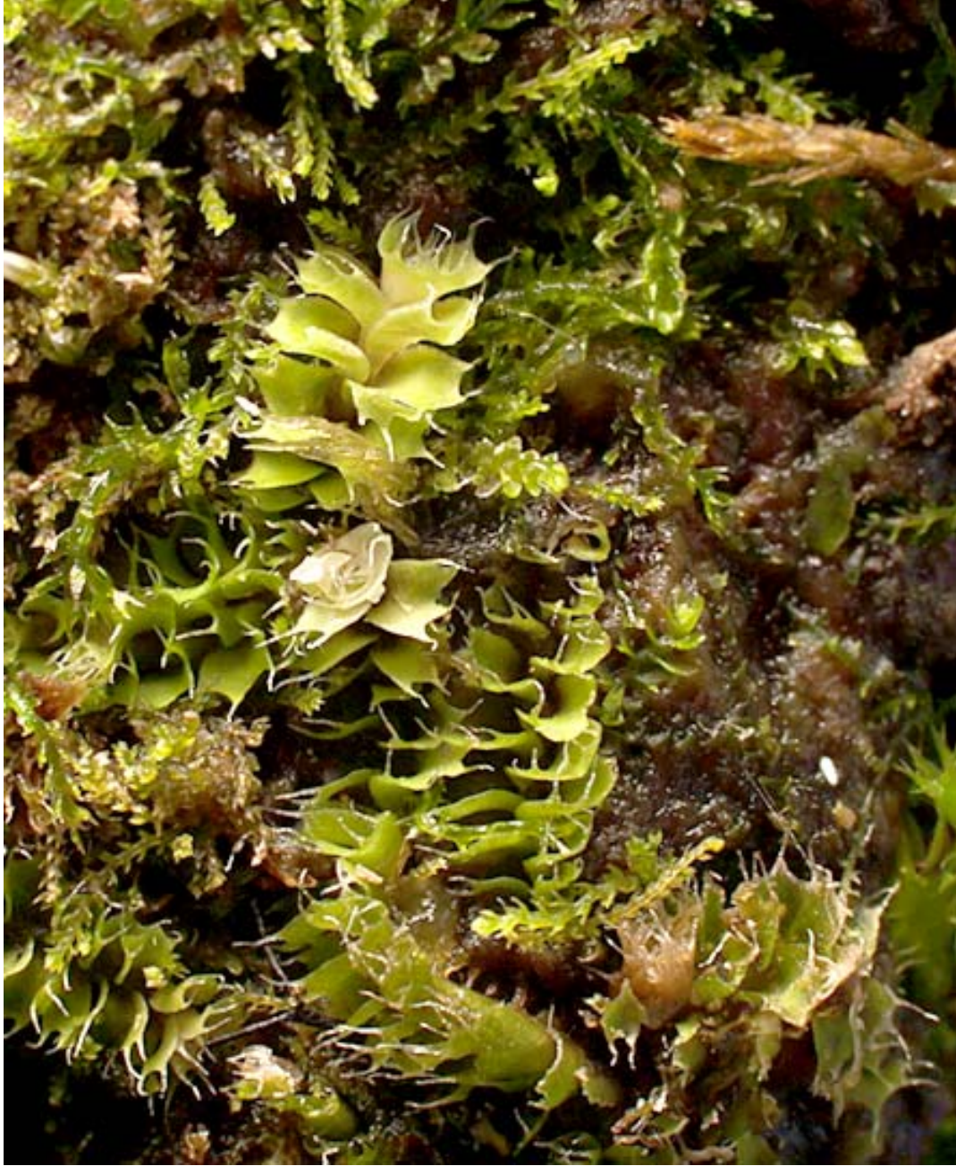
Fig. 1. Ruizanthus venezuelanus R.M. Schust. (Balantiopsidaceae).

included descriptions of a huge number of superfluous taxa (the necessary revision of the work is still ongoing). Because of this, possibilities for meaningful analysis of liverwort distributions at world level had long been limited. Schuster's first paper on the subject appeared in 1969 under the title " Problems on antipodal distribution in lower land plants ", being part a series of lectures on plant systematics, each by a different author, presented at the "Smithsonian Summer Institute in Systematics – 1968" and published in a special volume of TAXON . Schuster's contribution dealt with the geographic ranges of selected genera and families of liverworts with main distribution in the Southern Hemisphere, the area which