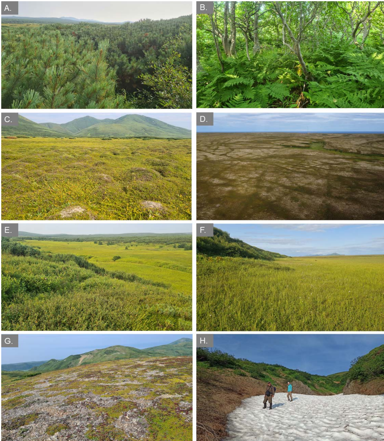
Fig. 2. Habitats of Karaginskii Island. A: Siberian dwarf pine communities; B: dwarf alder communities occupy large areas in lower mountain belt. C: Dwarf shrub tundra with Empetrum nigrum s.l. are common on the coastal plains. D: Dwarf shrub lichen tundra on the southern tip of the island. E: Mire complex on the western part of the island: dwarf shrub-moss, dwarf shrub-moss-lichen and cloudberry-moss peat bogs. F: Sedge and sedge-moss bogs. G: Moss-dwarf shrub-forb mountain tundra. H: Snowbeds are widespread on all altitudes.

posed of lower and middle Quaternary marine sediments: sands, loams, clays, pebbles, and boulders. Intrusive rocks play a significant role in the geological structure of the island. In the central, northeastern parts and in the extreme south of the island there are Late Cretaceous intrusions of ultrabasic rocks – peridotites, dunites and