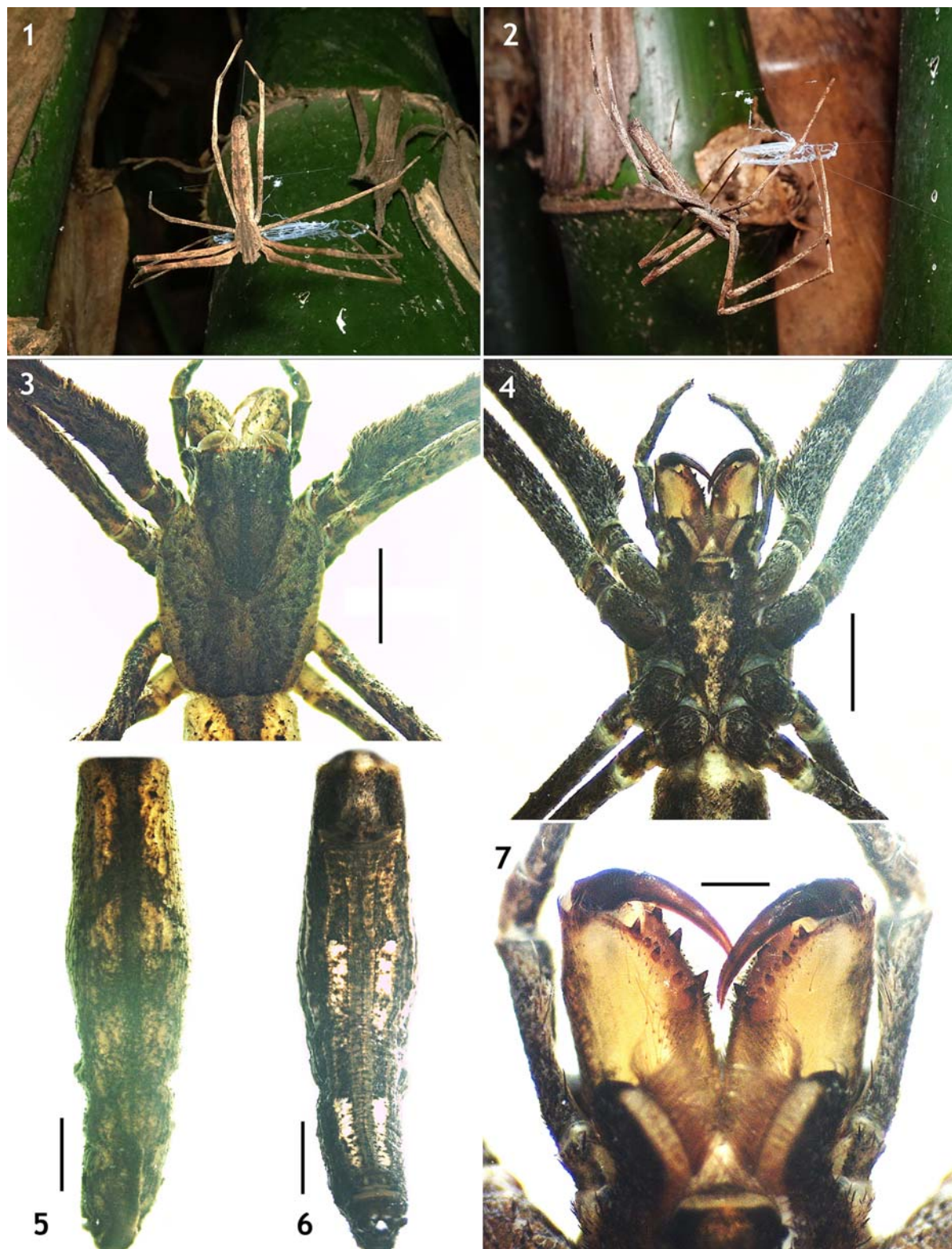
Figs 1–7. Somatic morphology of Asianopis goalparaensis (Tikader et Malhotra, 1978) comb.n., female: 1 — general appearance, dorsal view; 2 — ditto, lateral view; 3 — prosoma, dorsal view; 4 — ditto, ventral view; 5 — abdomen, dorsal view; 6 — ditto, ventral view; 7 — chelicerae, ventral view. Scale bars: (3–6) 2 mm, (7) 0.5 mm.

Рис. 1–7. Соматическая морфология Asianopis goalparaensis (Tikader et Malhotra, 1978) comb.n., самка: 1 — общий вид сверху; 2 — то же, сбоку; 3 — просома, сверху; 4 — то же, снизу; 5 — брюшко, сверху; 6 — то же, снизу; 7 — хелицеры, снизу. Масштаб: (3–6) 2 мм, (7) 0,5 мм.