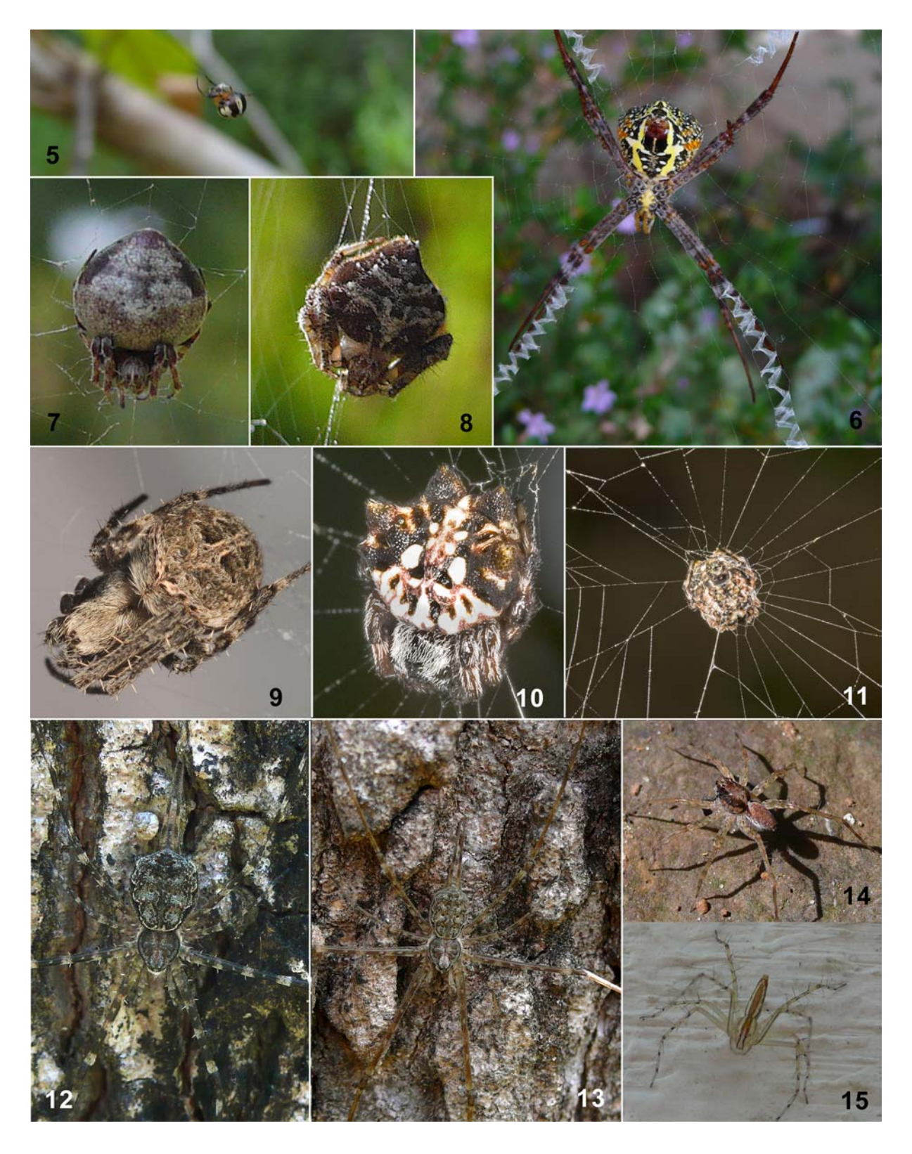
Figs 5–15. Habitus of the following speices: 5 — Anepsion japonicum; 6 — Argiope pulchella; 7 — Eriovixia excelsa; 8 — E. poonaensis; 9 — Neoscona polyspinipes; 10–11 — Thelacantha brevispina; 12–13 — Hersilia striata; 14 — Pardosa sumatrana; 15 — Oxyopes javanus; 5–12, 14–15 — females; 13 — male.