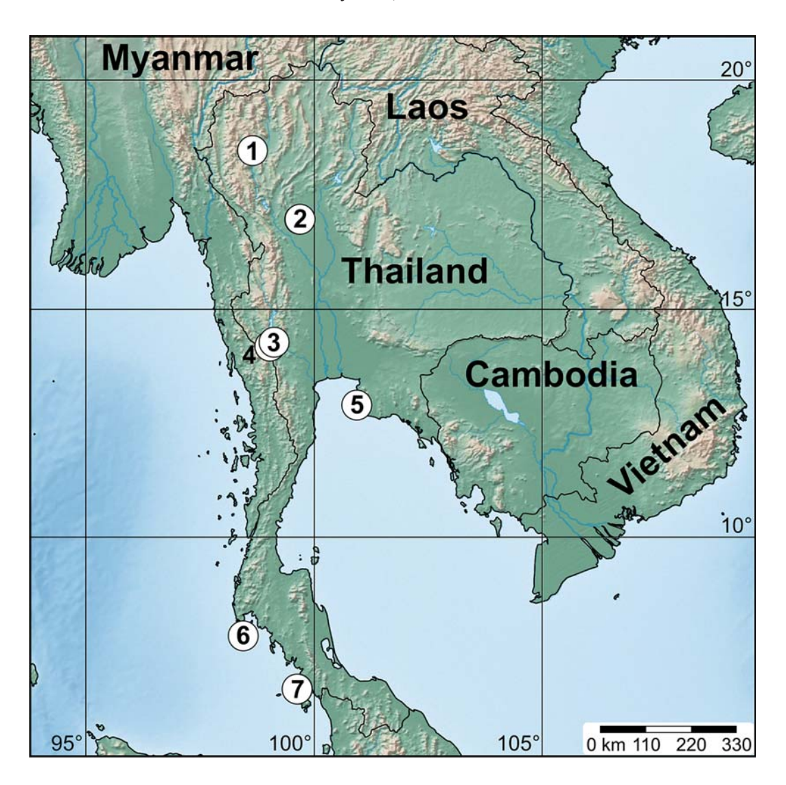
Map. Collecting localities: 1 — Ban Luang village; 2 — Sukhothai Historical Park; 3 — Eravan National Park; 4 — Sai Yok District; 5 — Pattaya city; 6 — Phuket Island; 7 — Tarutao National Park.

Карта. Точки сборов: 1 — деревня Бан Луанг; 2 — Исторический парк Сукхотай; 3 — Национальный парк Эраван; 4 — район Сай Йок; 5 — город Паттайя; 6 — остров Пхукет; 7 — Национальный парк Тарутао.