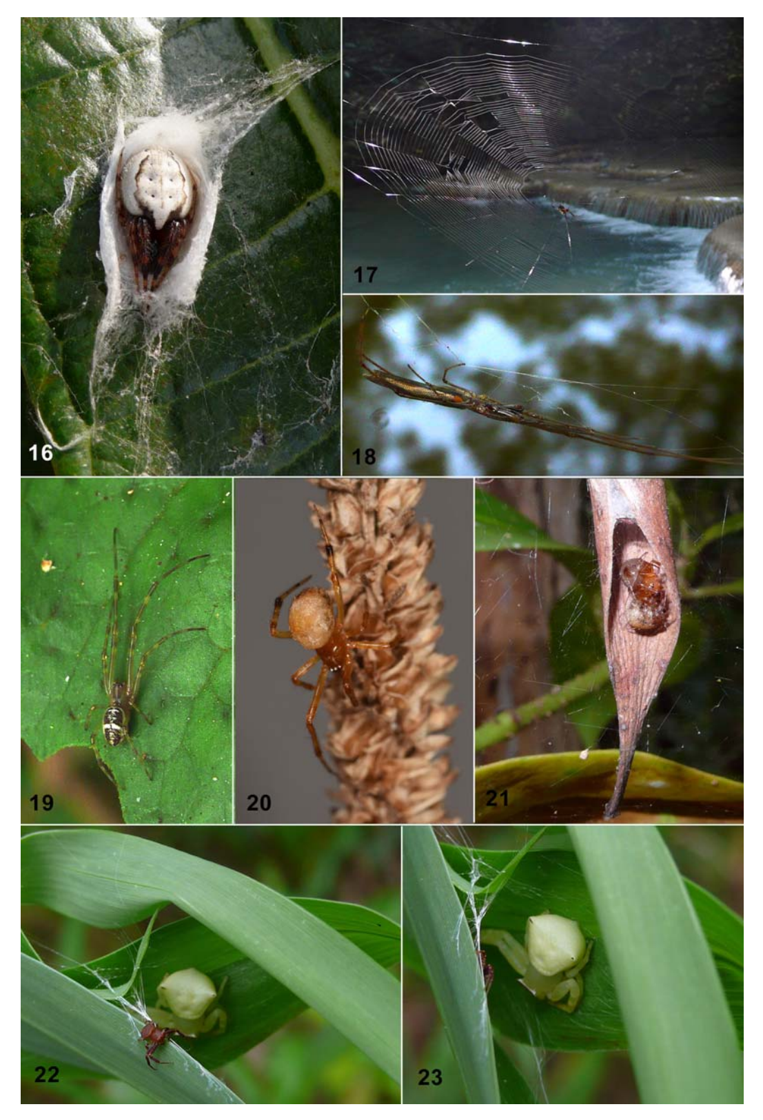
Figs 16–23. Habitus of the following species: 16 — Guizygiella nadleri ; 17 — Leucauge tessellata ; 18 — Tetragnatha mandibulata ; 19 — Tylorida ventralis ; 20–21 — Parasteatoda cingulata ; 22–23 — Thomisus labefactus ; 16–21 — females; 22–23 — male and subadult female.