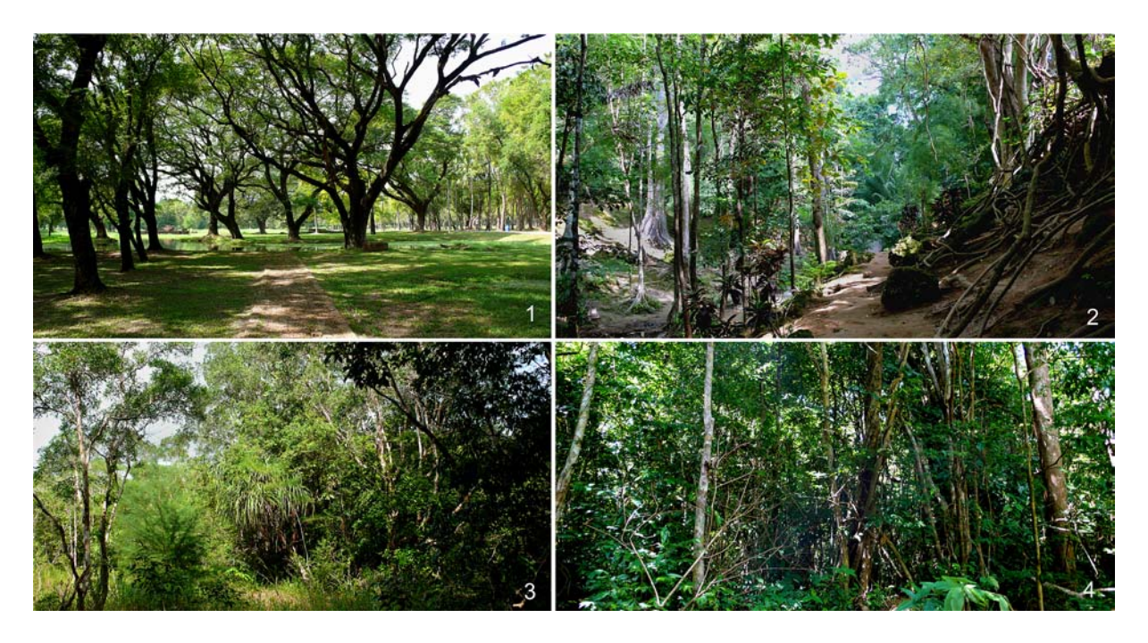
Figs 1–4. Sampling sites: 1 — Sukhotai Historical Park; 2 — Sai Yok Noi Waterfall surroundings; 3–4 — Tarutao National Park. Рис. 1–4. Места сборов: 1 — Исторический парк Сукхотай; 2 — окрестности водопада Сай Йок Ной; 3–4 — Национальный парк Тарутао.

Seyfulina et al. [2020] reported on new records of Salticidae from Thailand, with a checklist and chorological analysis. The present paper is a continuation of that study, presenting data on further seven families. The paper is aimed: (1) to provide new records for species collected during the fieldtrips to Thailand in 2011 and 2014; (2) to illustrate Argiope sapoa , Eriovixia yunnanensis , Janula triangularis , Parasteatoda cingulata and Larinia nolabelia , the species displaying unusual distribution and being recorded far from their currently known ranges; (3) to provide photographs of live specimens for 15 species; (4) to compose a detailed checklist of Thai spiders for the families Araneidae, Hersiliidae, Lycosidae, Oxyopidae, Theridiidae, Tetragnathidae, and Thomisidae.