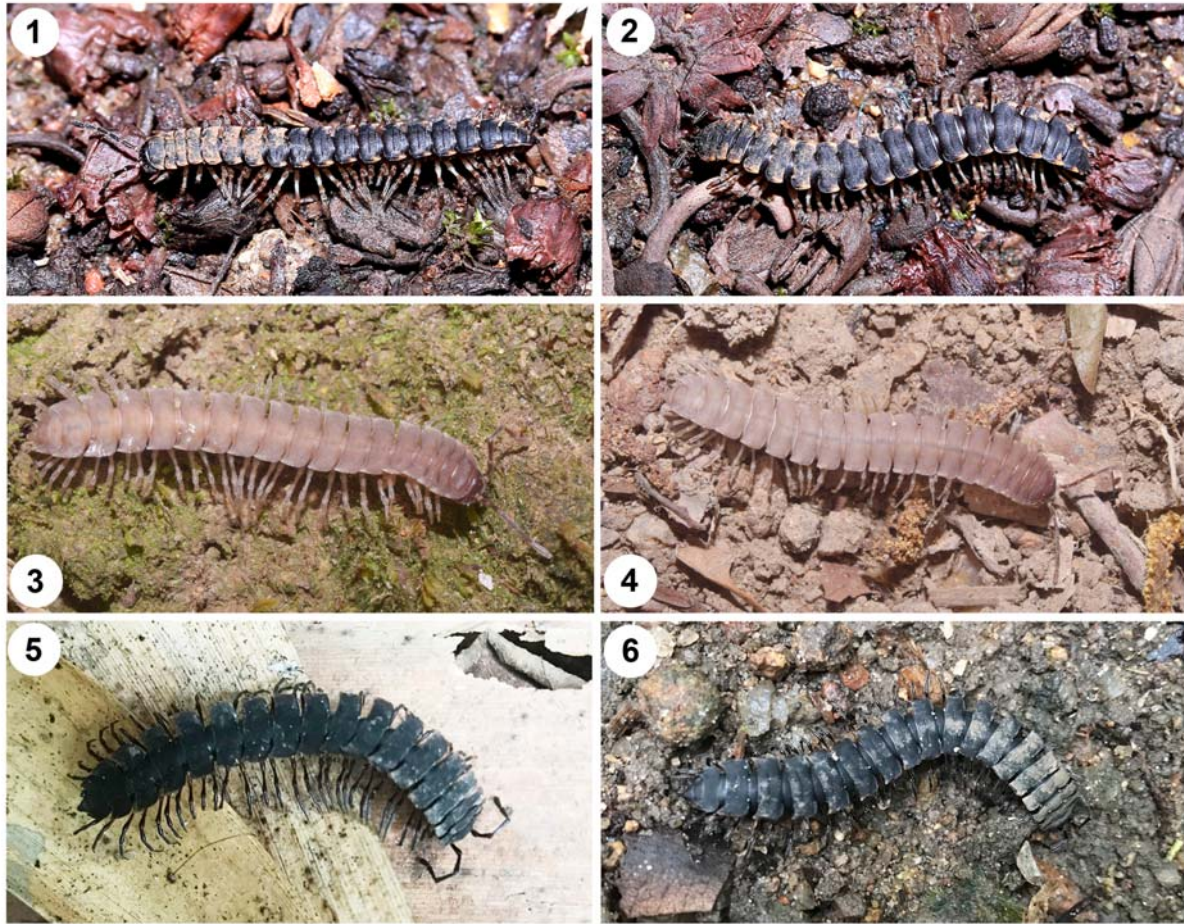
Figs 1–6. Field photographs of the colour morphs of Chondromorpha kelaarti (Humbert, 1865). 1–2 — morph A, 3–4 — morph B, 5–6 — morph C. 1, 3, 5 — males; 2, 4, 6 — females. Figs 1 and 2 reproduced from Sankaran & Sebastian [2017].

Рис. 1–6. Полевые фотографии цветовых морф Chondromorpha kelaarti (Humbert, 1865): 1–2 — морфа А, 3–4 — морфа В, 5–6 — морфа С. 1, 3, 5 — самцы; 2, 4, 6 — самки. Рис. 1 и 2 воспроизведены из Sankaran & Sebastian [2017].