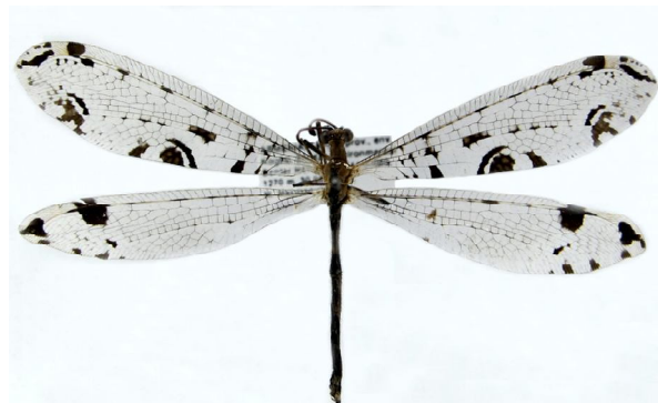
Fig. 1. External appearance of antlion Dendroleon pantherinus from Koghb vill. environs.