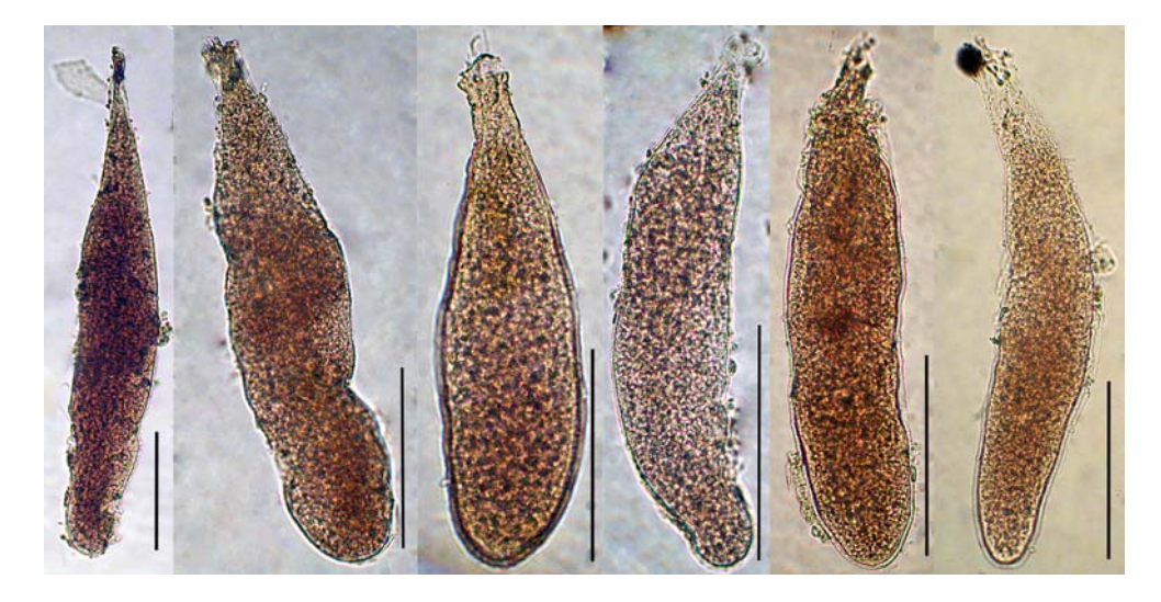
Fig. 3. Other investigated specimens of Vellaria solenta . Scale bars: 100 µm. Рис. 3. Другие исследованные экземпляры Vellaria solenta . Масштаб: 100 мкм.

Gooday et Bowser, 2004. The first two species, first described from the Vellar estuary in SW India (Gooday, Fernando, 1992), occur in both the Black Sea (Sergeeva, Anikeeva, 2004; Anikeeva, 2007; Gooday et al., 2011; Anikeeva, Gooday, 2016) and the Sea of Azov (Sergeeva, 2016) quite frequently. The morphological similarity between the new species and the two Indian species is in the structure of the apertural neck and test wall. The test of V. solenta is slightly more elongated than that of V. pellucida and V. sacculus. A distinctive feature of the new species is that the entire space of the test and apertural neck is completely filled with protoplasm. Also, the short, thin filaments that extend beyond the aperture in most individuals have not been observed in other species of the genus.