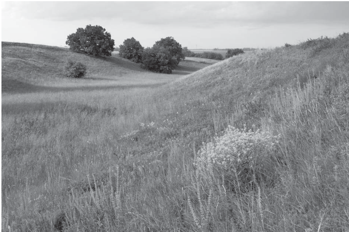
Fig. 2. The loess valley near Mezőföld (Hungary, Berhida) preserves many significant steppe elements. Рис. 2. Лёссовая долина в окрестностях Мезёфолда (Венгрия, Берхида), где сохранились степные ландшафты.