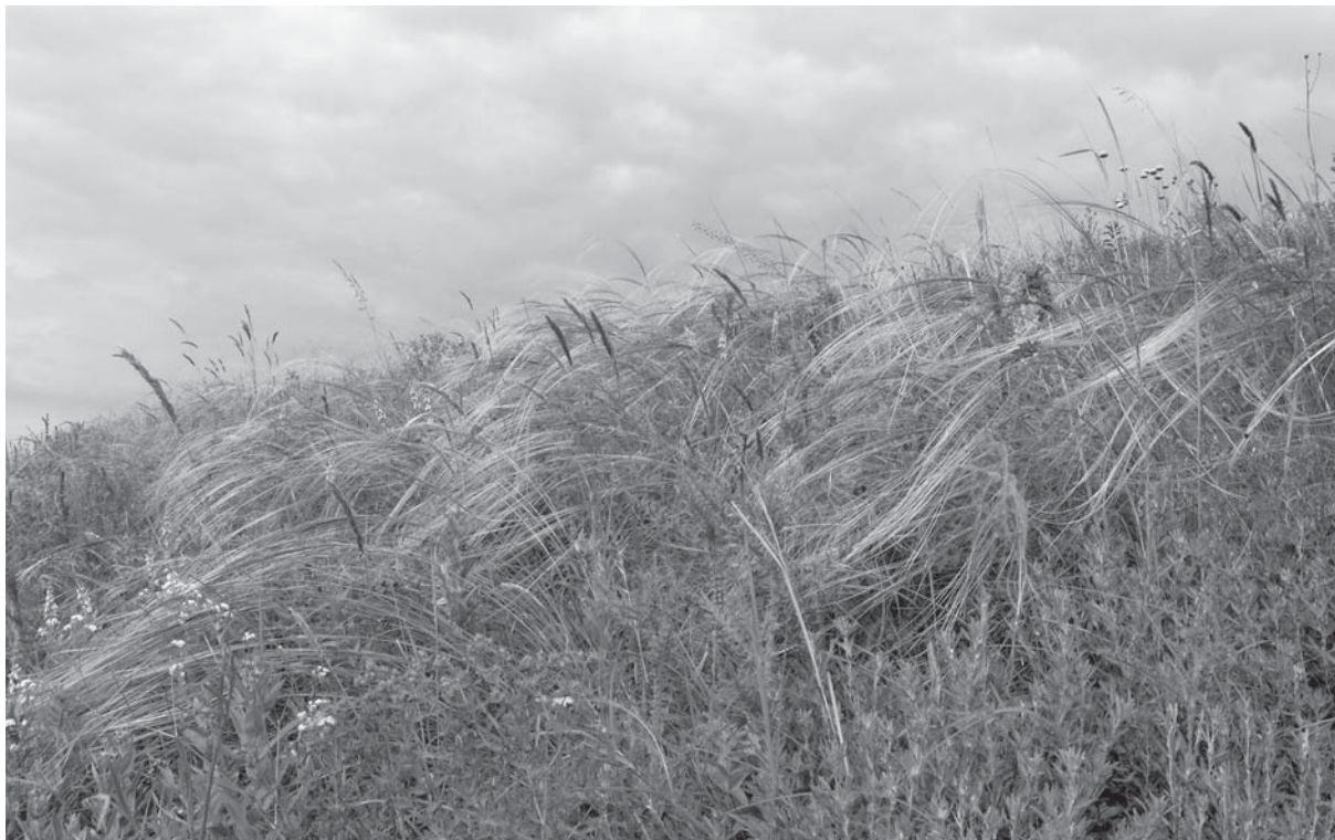
Fig. 3. Examined habitat of Poecilimon intermedius. Рис. 3. Исследованное местообитание Poecilimon intermedius.