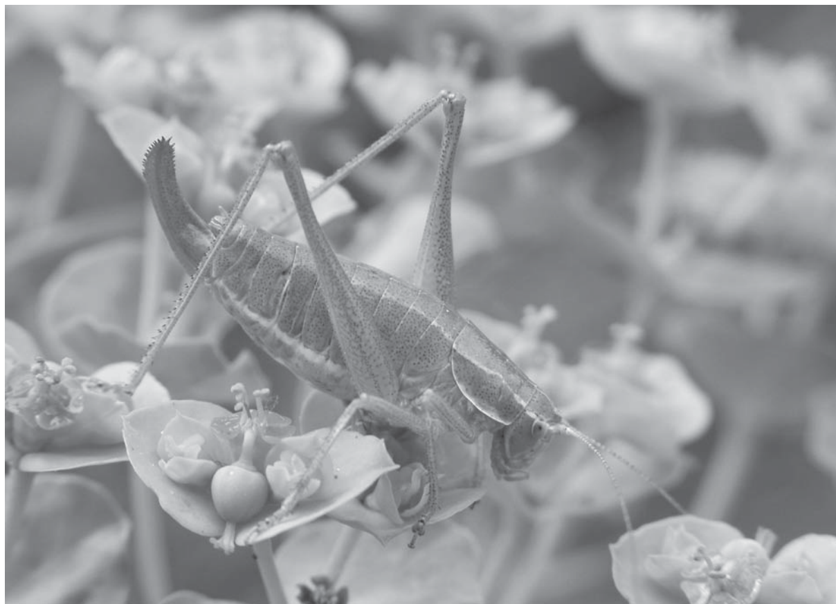
Fig. 1. Female Poecilimon intermedius (06.23.06. Hungary, Berhida,). Рис. 1. Самка Poecilimon intermedius (06.23.06. Венгрия, Берхида,).