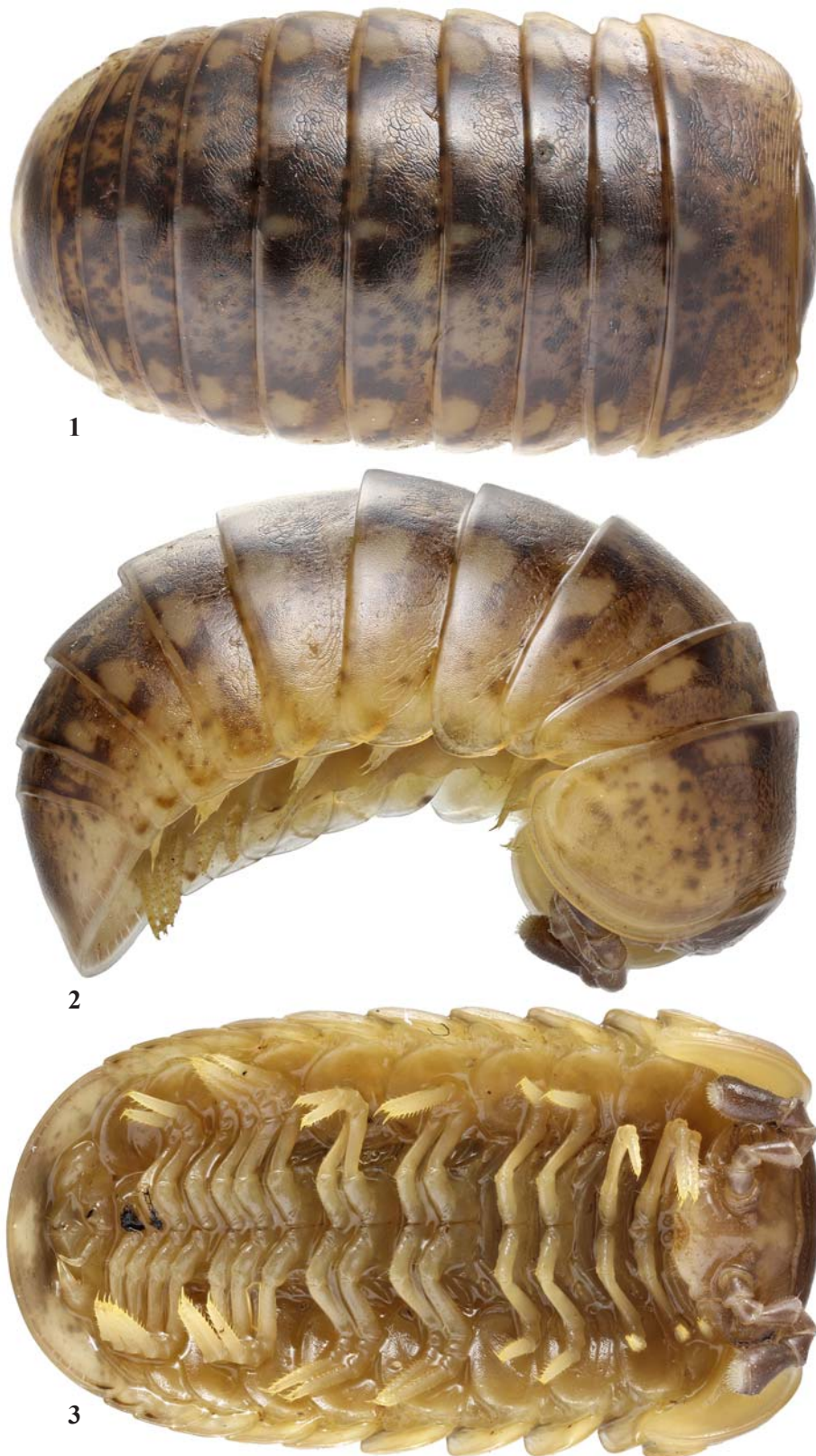
Figs 1–3. Habitus of Rhopalomeris variegata sp.n., ♂ holotype: 1 — dorsal view; 2 — lateral view; 3 — ventral view. taken not to scale.

Рис. 1–3. Общий вид Rhopalomeris variegata sp.n., голотип ♂: 1 — сверху; 2 — сбоку; 3 — снизу. снято без масштаба.