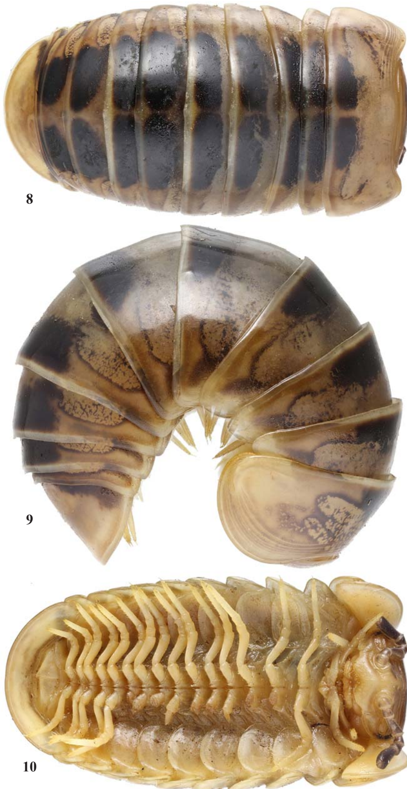
Figs 8–10. Habitus of Hyleoglomeris cattienensis sp.n., ♀ paratype: 8 — dorsal view; 9 — lateral view; 10 — ventral view (most of the legs on the left side of the body cut off for chemical analyses). Pictures by K. Makarov, taken not to scale.

Рис. 8–10. Общий вид Hyleoglomeris cattienensis sp.n., паратип ♀: 8 — сверху; 9 — сбоку; 10 — снизу (большинство ног на левой стороне тела отрезаны для химических анализов). Фотографии К. Макарова, снято без масштаба.