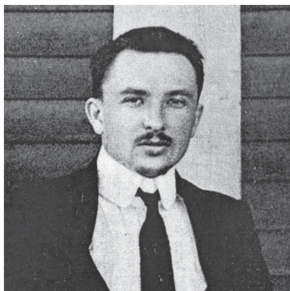
Fig. 1. N.V. Kurdyumov, photography taken in 1909 in USA [from Howard, 1930].

F — the abbreviation for a funicular segment of female antenna.