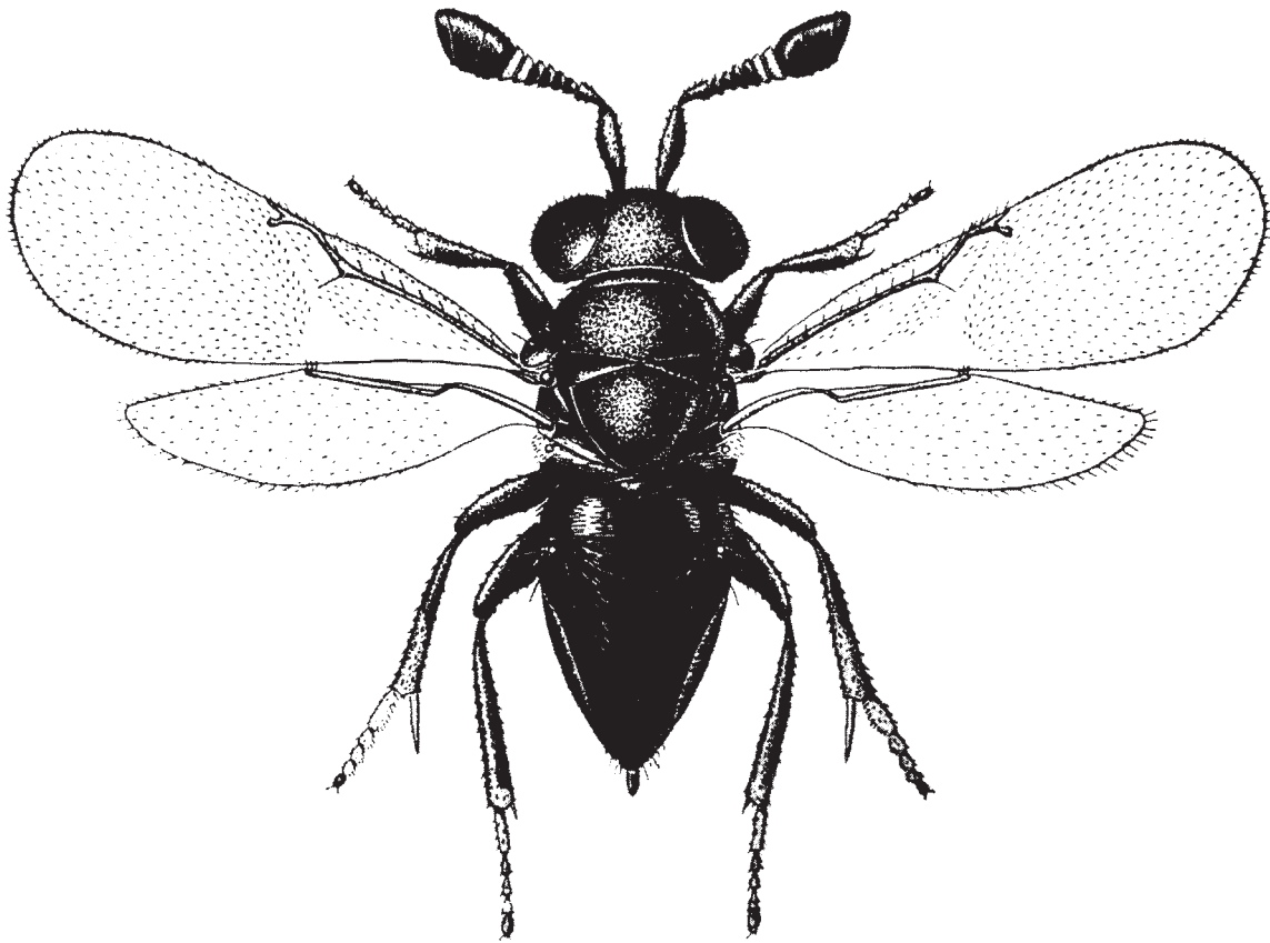
Fig. 2. Tyndarichus melanacis , female habitus [from Erdős, 1964].

Рис. 2. Tyndarichus melanacis , габитус самки [по: Erdős, 1964].