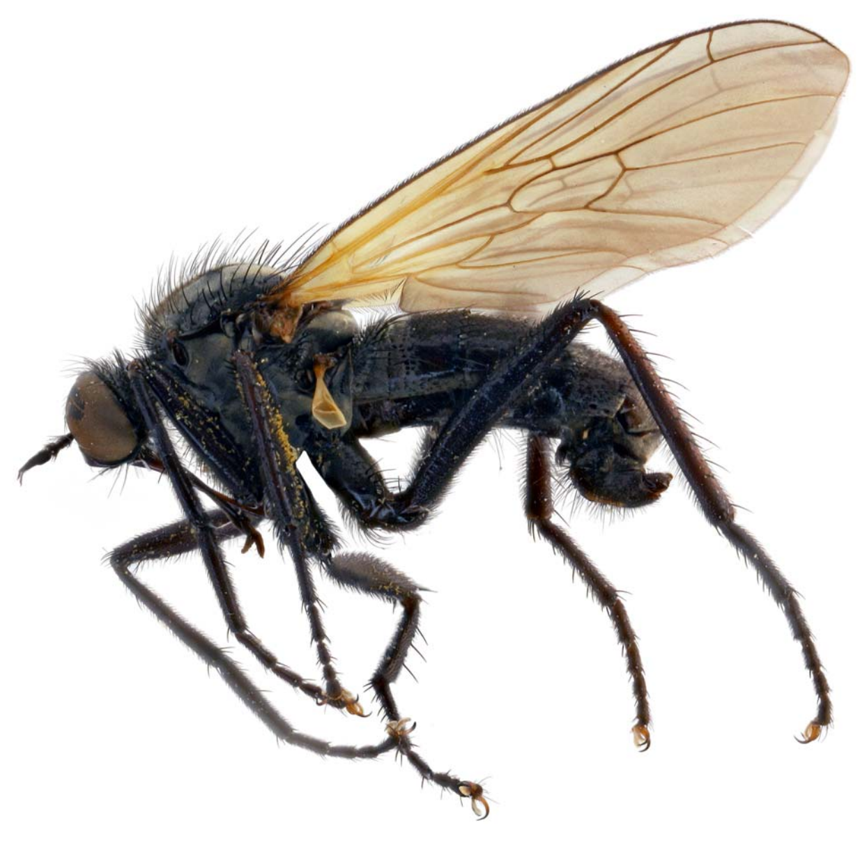
Fig. 1. Empis (Anacrostichus) kustovi sp.n. , ♂, habitus, lateral view. Рис. 1. Empis (Anacrostichus) kustovi sp.n. , габитус самца, вид сбоку.

DESCRIPTION. Male (Fig. 1). Head black in ground colour, with black setation. Eyes dichoptic; ommatidia of equal size. Frons narrow on upper part, 1.5–2 times broader than anterior ocellus but broadened above antennae; densely brownish pollinose, with marginal setulae. Face considerably broader than frons above antennae, somewhat broadened downwards, bare, densely greyish pollinose but clypeus sub-