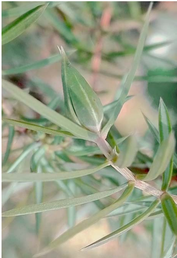
Fig. 2. Gall of Oligotrophus panteli on Juniperus communis . Berezinsky Biosphere Reserve, April 2016.

Рис. 2. Галл Oligotrophus panteli на можжевельнике Juniperus communis . Березинский биосферный заповедник, апрель 2016.