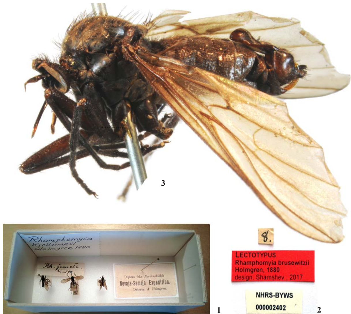
Figs 1–3. Rhamphomyia ( Dasyrhamphomyia ) brusewitzii Holmgren, 1880: 1 — syntypes; 2 — lectotype labels; 3 — lectotype male, lateral view.

Legs robust, entirely dark brown, uniformly faintly greyish pollinose, with black setation. Coxae and trochanters with numerous bristles of different lengths. Femora of subequal width, hind tibia somewhat thicker than fore and mid tibiae, tarsomeres of all legs slender. Fore femur faintly pubescent ventrally, with numerous short to moderately long, bristle-like anteroventral and posteroventral setae arranged irregularly (not forming regular rows), without setae ventrally (except near extreme base). Fore tibia with 5–7 short anterodorsal and similar posterodorsal bristles (number and position variable). Fore tarsomeres with very short subapicals, otherwise covered with ordinary setulae. Mid femur with similar pattern of setation to fore femur, including faint ventral pubescence, but anteroventral and posteroventral setae shorter, more numerous and rather spine-like, posteroventrals longer. Mid tibia shorter than fore and hind tibiae, bearing several short anterodorsal and posterodorsal bristles, with some spinule-like setae on subapical part ventrally. Mid