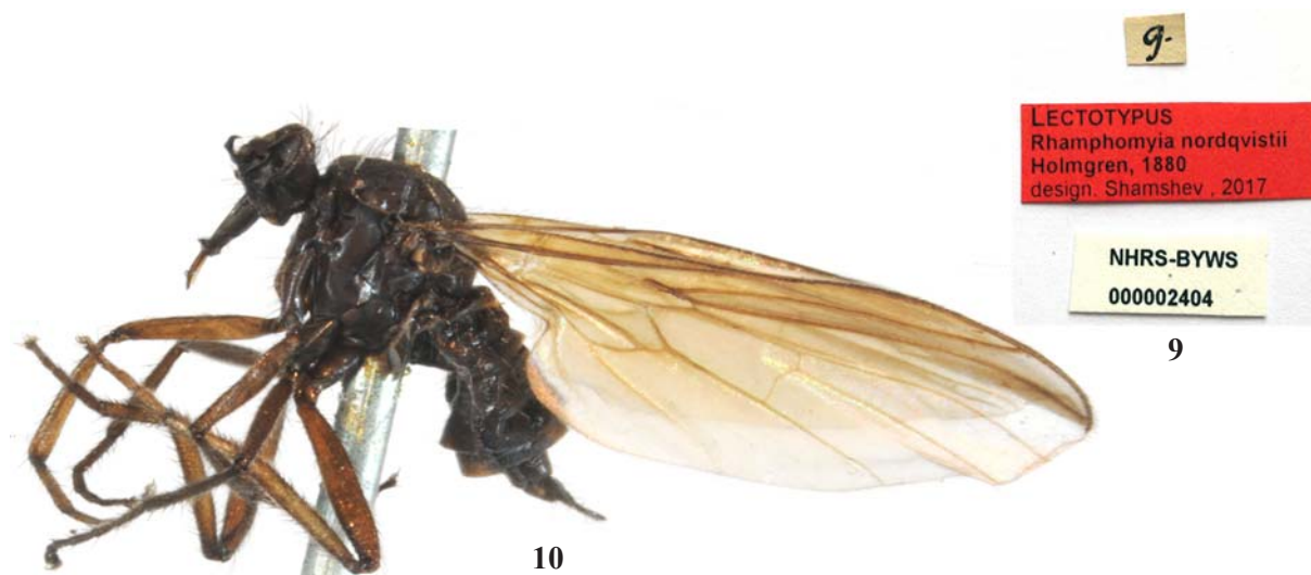
Figs 9–10. Rhamphomyia ( Pararhamphomyia ) nordqvistii Holmgren, 1880: 9 — lectotype labels; 10 — lectotype female, lateral view. Рис. 9–10. Rhamphomyia ( Pararhamphomyia ) nordqvistii Holmgren, 1880: 9 — этикетки лектотипа; 10 — лектотип, самка, сбоку.