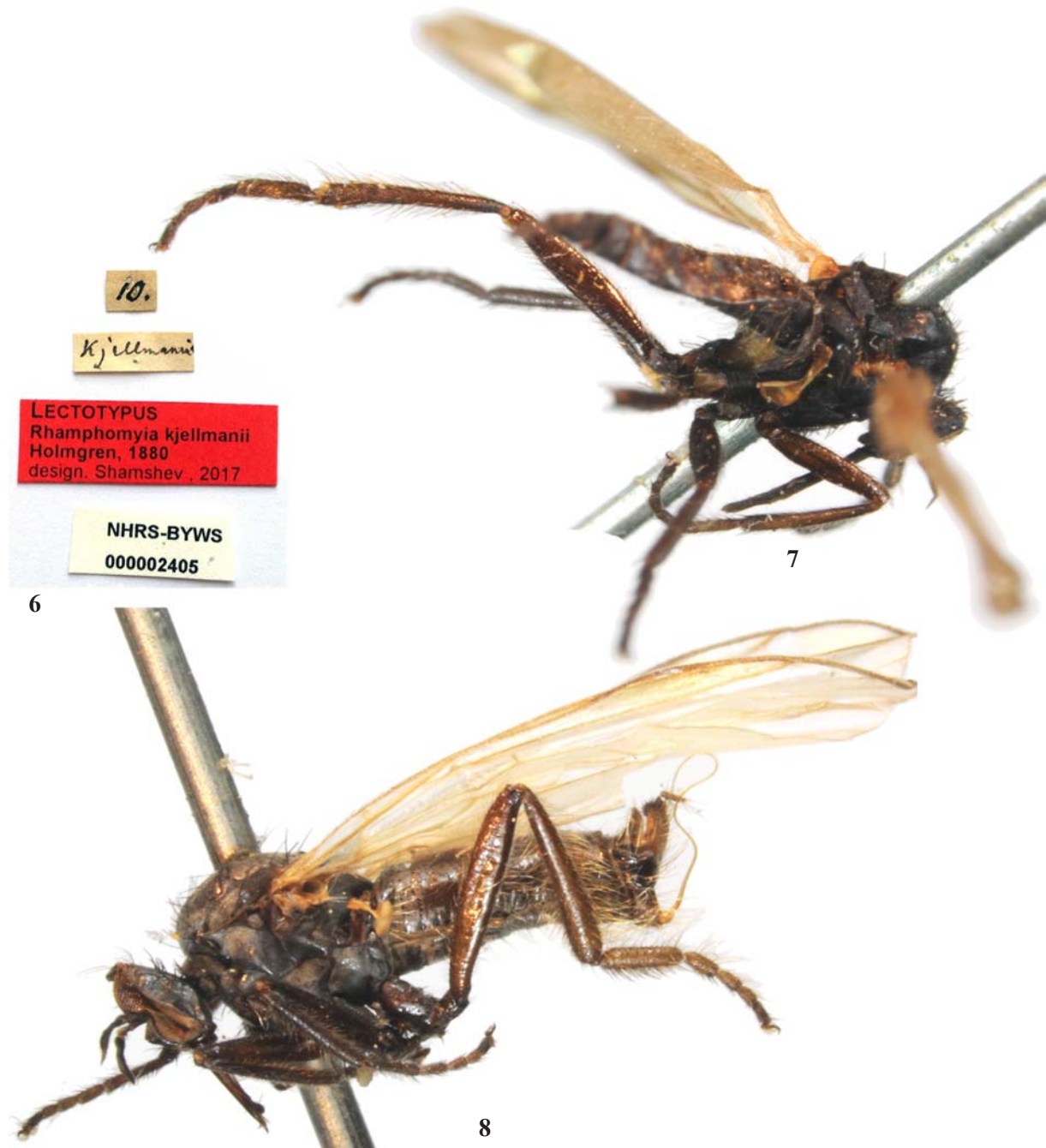
Figs 6–8. Rhamphomyia ( Pararhamphomyia ) kjellmanii Holmgren, 1880: 6 — lectotype labels; 7 — lectotype female, postero-lateral view; 8 — male, lateral view.

ordinary setation, almost bare ventrally, anteroventral and posteroventral setae minute. Fore tibia with ordinary setation somewhat longer posteriorly; bristles of subapical cirlet short (except 1 anterodorsal and 1 posteroventral). Fore basitarsus with several more prominent short ventral setae, otherwise with ordinary setation, bristles of subapical cirlet short. Mid femur whitish pubescent ventrally, with very short anteroventral and longer posteroventral setae. Mid tibia somewhat shorter and thicker than fore tibia, with regular row of numerous short posteroventral setae, bristles of subapical cirlet moderately long. Mid basitarsus with numerous ventral, short spine-