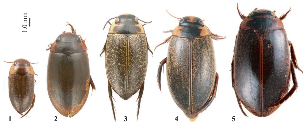
Figs 1–5. Habitus of Rhantus spp.: 1 — R. lattkei sp.n. ; 2 — R. marahuaca sp.n. ; 3 — R. elegans ; 4 — R. andinus (Colombia, Bogota, La Florida); 5 — R. andinus (Venezuela, Merida, Azulita).

COMPARATIVE NOTES. A species well-characterized by the following set of features: small size, pronotum double axhead shaped (Fig. 1); prosternal process short, broadly rounded ventrally and almost diamond shaped (Fig. 12); parameres with few short setae only (Fig. 8); lateral wings of metaventrite rather narrow (Fig. 14); hind wings vestigial.