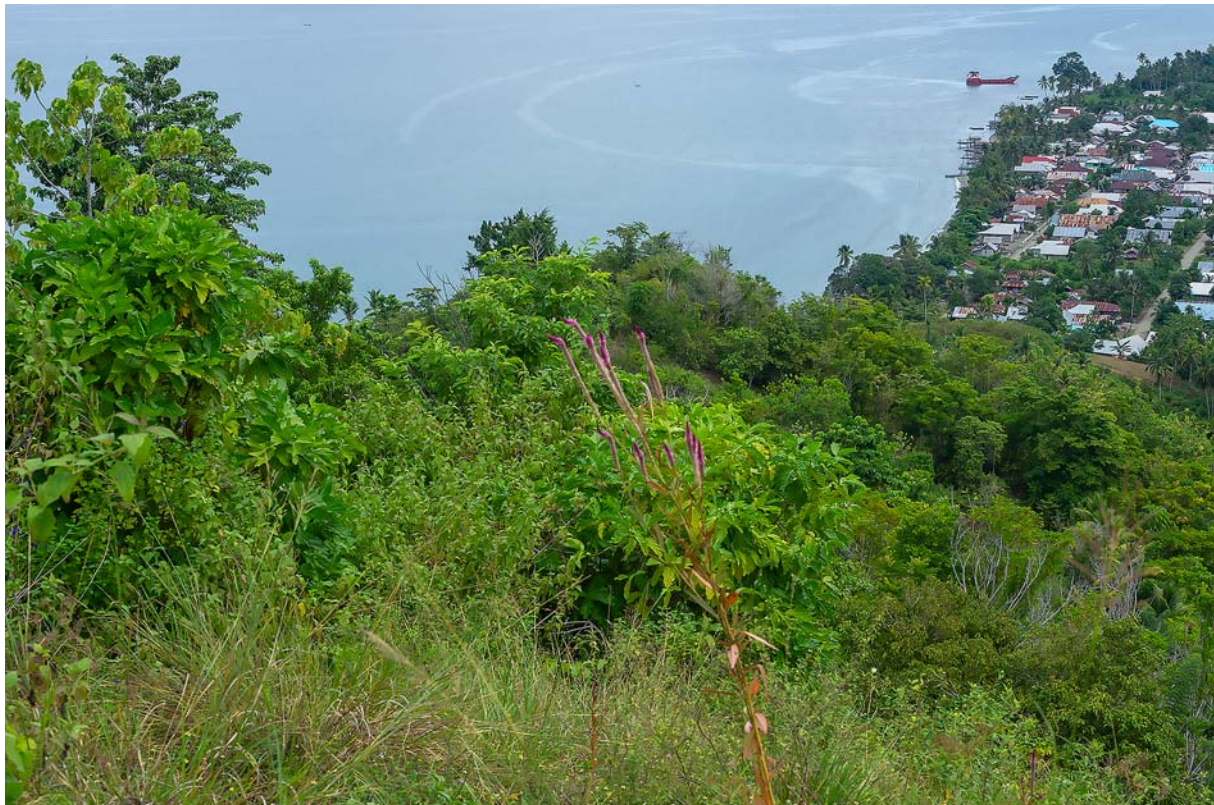
Fig. 7. Habitat of Cyanosesia tuzovi sp.n. : Indonesia, North Maluku, Obi Island, 3 km SW of Laiwui, 01°21.43' S, 127°37.33' E, 115 m, 25.II.2017.

* According to Clarke, the actual date of publication of the 257 issue of the Bulletin of the United States National Museum is January 31st, 1968 (“1868” in the text!) [Clarke, 1980].