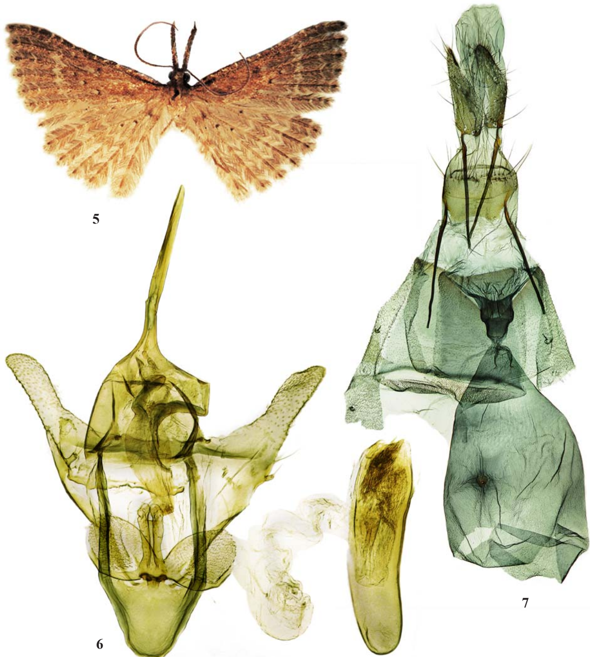
Figs 5–7. Microschismus premnias Meyrick, 1913: 5 — adult (Lectotype, TMSA); 6 — male genitalia (Lectotype, TMSA gen.pr. Nr. 15966); 7 — female genitalia (CUK, gen.pr. Nr. 318).

DISTRIBUTION. Rep. S. Africa: KwaZulu Natal, Gauteng, Northern Cape [Ustjuzhanin, Kovtunovich, 2017], Free State.