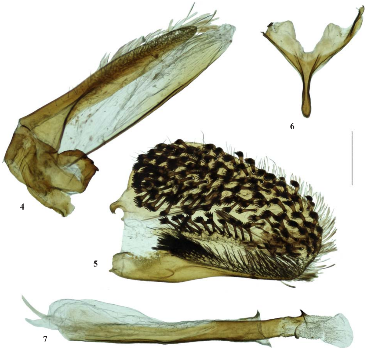
Figs 4–7. Male genitalia of Scolioikona baliensis sp.n., holotype. Genital preparation № OG–001-2021: 4 — tegumen-uncus complex; 5 — valva; 6 — saccus; 7 — aedeagus. Scale bar: 0.5 mm.

Thorax with patagia orange with an admixture of a few black scales with greenish-violet sheen dorsally; tegula, meso- and metathorax and thorax laterally entirely black with bright greenish-violet sheen; posteriorly dark gray with greenish-bronze sheen covered with long white hair-like scales. Legs with neck plate orange with a few black scales with greenish sheen laterally; fore, mid and hind legs entirely black with violet-anthracitic sheen; both fore femur and fore tibia posteriorly with elongate hair-like scales forming a well-visible tuft; spurs mid and hind tibiae dark gray with anthracitic sheen internally. Forewing completely opaque; dorsally black with bright blue-violet sheen; cilia dark brown to black with dark violet sheen; ventrally dark brown to black with bright blue sheen gradually changing to violet distally of cross-vein; cilia dark brown to black with bronze-violet sheen. Hindwing with scales black with bright blue sheen dorsally and blue-violet sheen ventrally; with seven oval transparent areas in