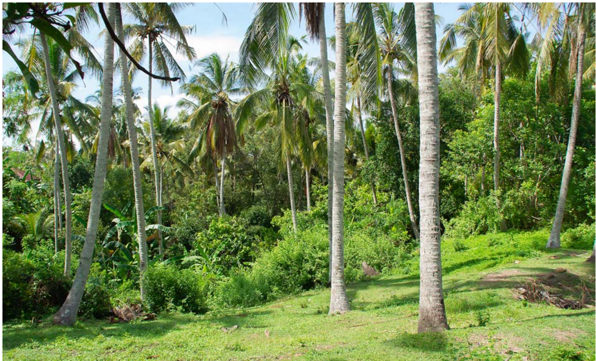
Fig. 1. Type locality of Scoliokona baliensis sp.n. Indonesia, Bali, Tabanan, Lalah Linggah, 08°29.567’ S, 114°58.287’, 50 m, 11.II.2020.

MATERIAL. Holotype ♂ (Figs 2–3) with labels: “Indonesia, Bali, / Tabanan, Lalah Linggah, / 08°29.567’ S, 114°58.287’, / 50