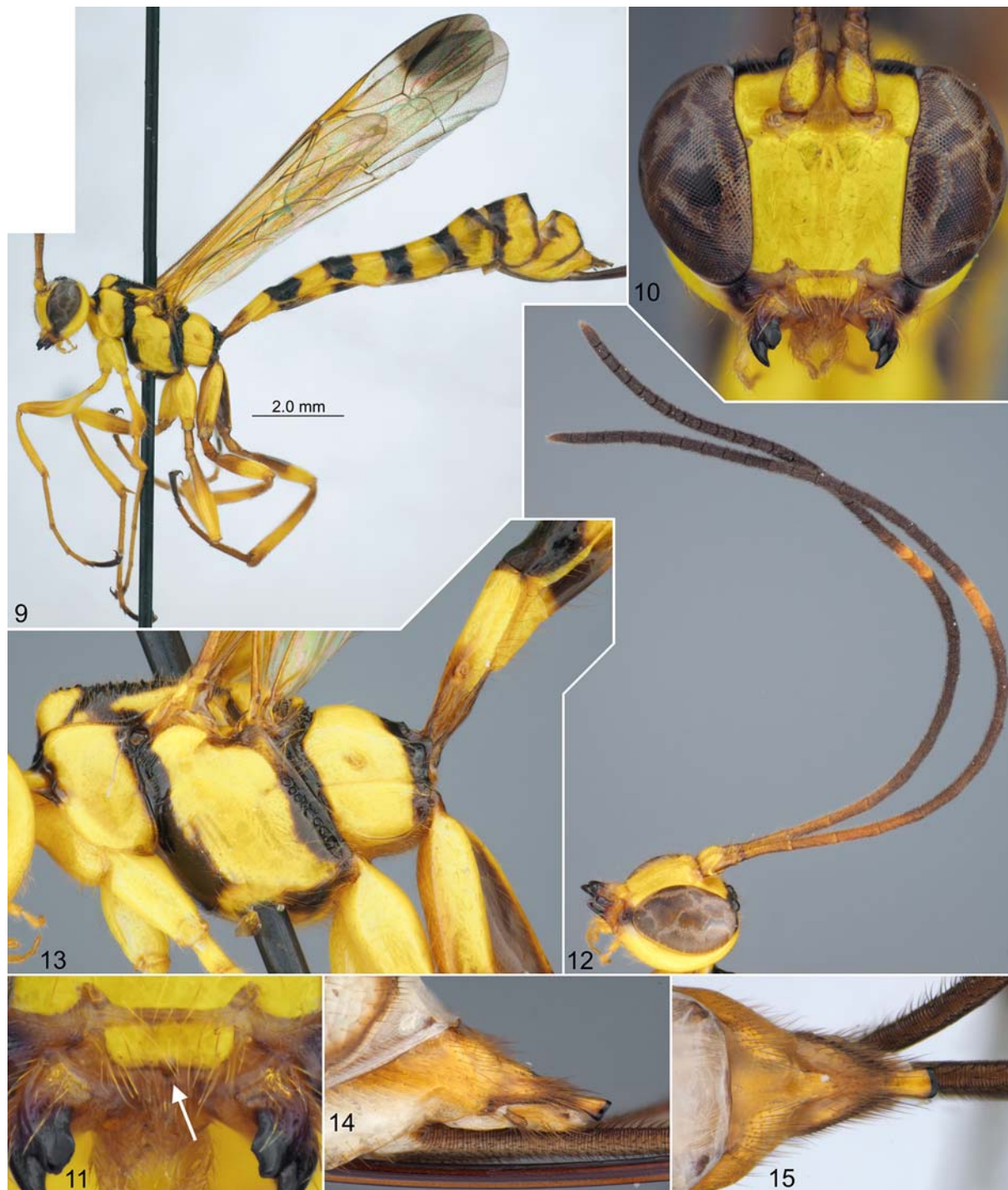
Figs 9–15. Epirhyssa oaxaca , female: 9 — habitus (without antennae and ovipositor), lateral view; 10 — head, front view; 11 — clypeus, front view; 12 — head with antennae, lateral view; 13 — mesosoma and base of metasoma, lateral view; 14 — apex of metasoma, lateral view; 15 — apex of metasoma, dorsal view.

DISTRIBUTION. Mexico (Veracruz), Costa Rica. First record from Mexico.