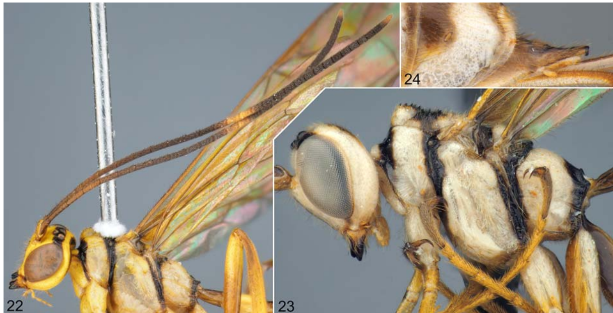
Figs 22–24. Epirhyssa theloides , female: 22 — head with antennae, lateral view; 23 — head and mesosoma, lateral view; 24 — apex of metasoma, lateral view.

MATERIAL EXAMINED. Mexico, Veracruz: San Andrés, Biological Station Los Tuxtlas, 150–210 m, selva alta perennifolia, Malaise trap, coll. M. Madora: 10.III–14.IV.2013, 1 ♀ (UNAM); 13.V–16.VI.2013, 1 ♀ (UNAM); 30.XI–17.XII.2013, 1 ♀ (ZISP); 16–31.III.2014, 1 ♀ (UNAM); 14.VII–1.VIII.2014, 1 ♀ (ZISP). Guatemala: Guatemala Department, Fraijanes, Finca San Antonio, 1800 m, VI.1987, coll. Mauger, 2 ♀♀ (AEIC). Costa Rica: Heredia Prov., Braulio Carrillo National Park, 9 km E of El Tunel, 1000 m, IX.1990, coll. I.D. Gauld, 1 ♀ (det. I.D. Gauld; UAT).