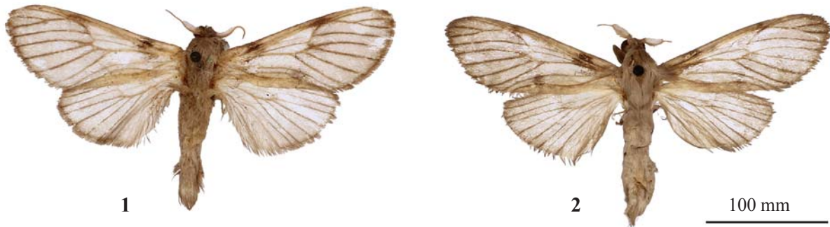
Figs 1–2. Schreiteriana klagesi Yakovlev, Naydenov et Penco, sp.n. , adult specimens, males: 1 — holotype; 2 — paratype. Рис. 1–2. Schreiteriana klagesi Yakovlev, Naydenov et Penco, sp.n. , имаго, самцы: 1 — голотип; 2 — паратип.

Male genitalia (Slides NHMUK: 010315523 and 010315524). Uncus long, with triangle base, pin-likely narrowing in medium third, apex spear-pointed; gnathos arms ribbon-like, relatively wide, smoothly narrowing from base to apex; gnathos absent; valve gradually narrowing from base to apex, relatively narrow, apex semicircular, costal edge almost smooth, abdominal edge (2/3 of its proximal part) wavy, with semicircular notches; juxta robust, semicircular, with long wide ribbon-like lateral processes; saccus semicircular, massive; phallus thick, of equal thickness throughout its length, slightly curved in medium third, with spirally curved big lamellar cornutus and a large zone of scabination in basal portions of vesica.