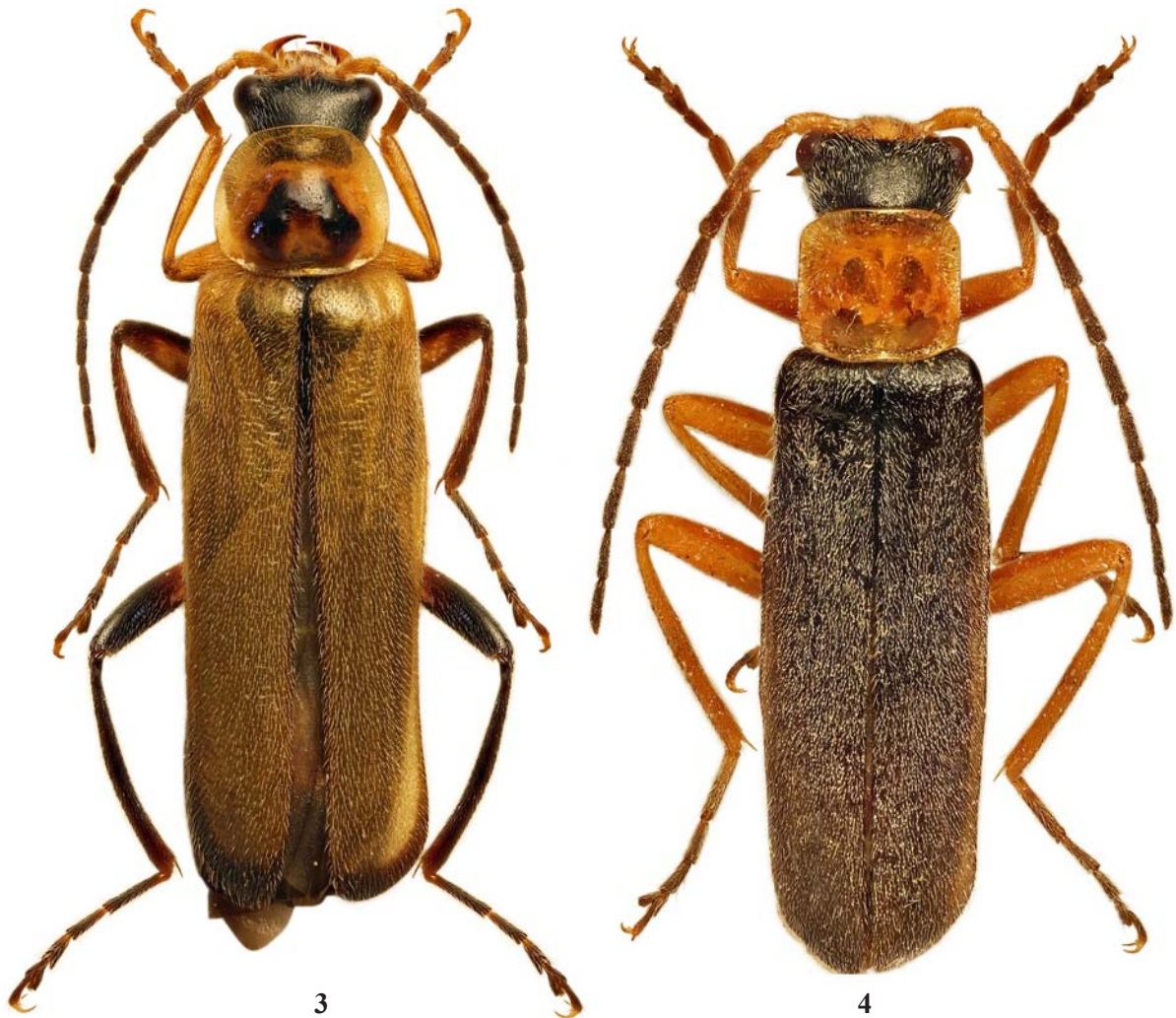
Figs 3–4. General view of Cantharis , males: 3 — C. terminata ; 4 — C. pygmaea . Рис. 3–4. Общий вид Cantharis , самцы: 3 — C. terminata ; 4 — C. pygmaea .

This description, although brief, allows rather confident attribution of the taxon, which is in fact related and similar to C. lateralis , distinguishable by the absence of light margin on the elytra (Fig. 4). Cantharis pygmaea is distributed in the steppe and semi-desert areas of southern Russia (Dagestan, Volgograd Oblast), also from Azerbaijan ('Lenkoran') [Ménériés, 1832], Turkmenistan, Uzbekistan and Iran to Mongolia [Kazantsev, Brancucci, 2007; Kazantsev, 2011]. The species C. edentula (Baudi, 1872) and C. beckeri (Pic, 1902) described, respectively, from southern Russia ('Ross. mer.') and Volgograd Oblast ('Sarepta') [Baudi a Selve, 1872; Pic, 1902], are very similar to C. lateralis as well, also differing by the uniformly black elytra. Both of them were notably introduced without being compared to C. pygmaea . Syntypes of Rhagonycha beckeri Pic, 1902 from the Museum of Natural History in Paris and the Zoological Institute in Saint-Petersburg were studied, and the taxon was transferred first from Rhagonycha to Cantharis and then to the subgenus Cyrtomoptila [Dahlgren, 1972; Kazantsev, 2010]. The type of C. edentula has not been found yet. Nevertheless, as there seem to occur just one such cantharine in the Pre- and Transcaspian steppe and semi-desert areas, and as the three above-mentioned species apparently belong to a single taxon,