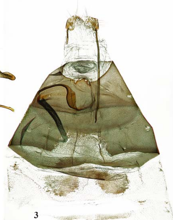
Figs 1–3. Singularia zolotuhini sp.n.: 1 — adult, male, holotype; 2 — male genitalia, holotype (ZISP, gen.pr. Nr. 1960); 3 — female genitalia, paratype (ZISP, gen.pr. Nr. 1961).

Рис. 1–3. Singularia zolotuhini sp.n.: 1 — имаго, самец, голотип; 2 — гениталии самца, голотип (ZISP, gen.pr. Nr. 1960); 3 — гениталии самки, паратип (ZISP, gen.pr. Nr. 1961).