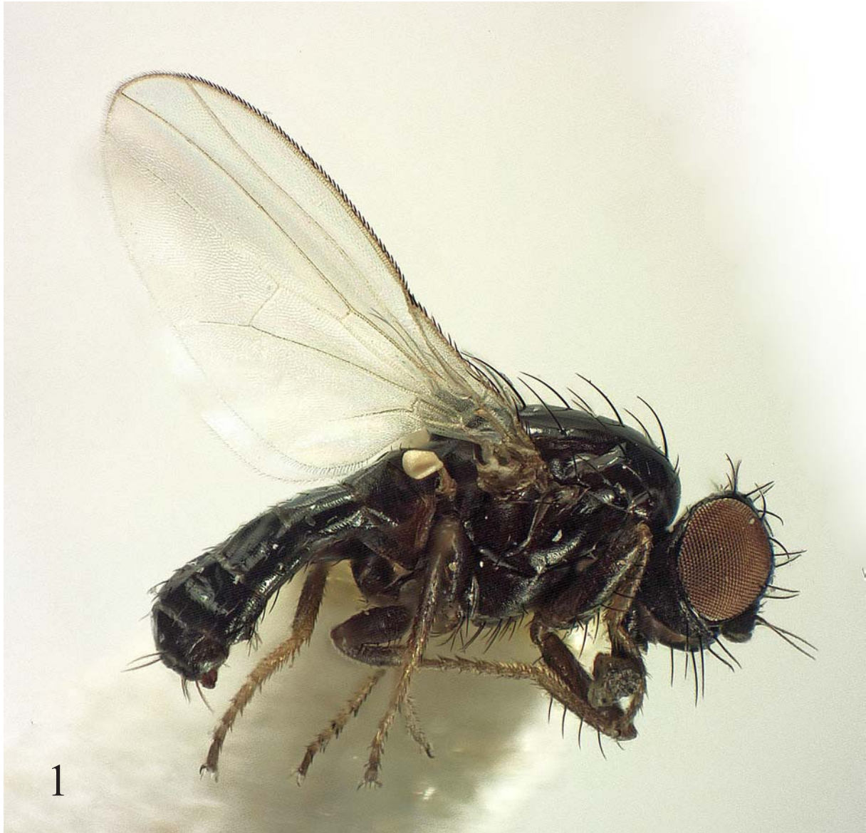
Fig. 1. Hemeromyia leucoptera sp.n., holotype male. Рис. 1. Hemeromyia leucoptera sp.n., голотип самец.

following features: 1) wing with cell dm long, 2) crossveins r-m and dm-cu widely separated, 3) costal vein extending to vein M_1 , 4) cell cup closed, 5) vein A_1+CuA_2 strong (Fig. 1). The species of Meoneura are characterized by wing with cell dm short, crossveins r-m and dm-cu narrowly separated; costal vein ending at R_{4+5} ; cell cup open; vein A_1+CuA_2 weak, streak-like.