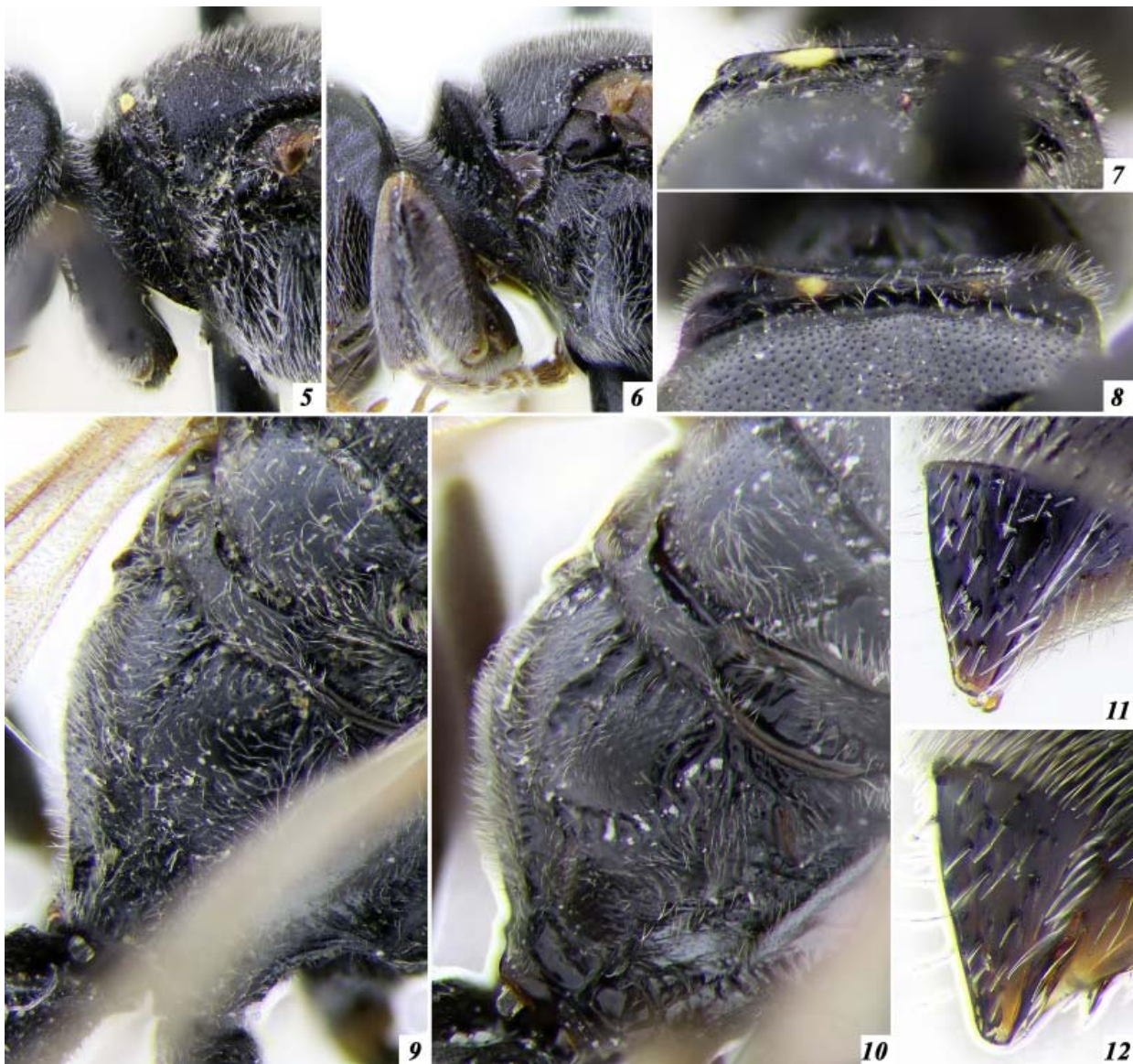
Figs 5–12. Females of Crossocerus mongolensis Tsuneki, 1972 (5, 7, 9, 11) from Altai and C. yasumatsui (Tsuneki, 1947) from Kunashir Island (6, 8, 10, 12): 5, 6 — pronotal collar, lateral view; 7, 8 — pronotal collar, back view; 9, 10 — metapostnotum and propodeum, dorsolateral view; 11, 12 — pygidial area, dorsolateral view.

DISCUSSION. K. Tsuneki [1972] described Crossocerus yasumatsui mongolensis very briefly, indicating as a difference only the smoother sculpture of the metapostnotum and propodeum of female. Based on a comparison of females, P. Nemkov [2004: 254] synonymized Crossocerus yasumatsui mongolensis Tsuneki, 1972 with C. yasumatsui (Tsuneki, 1947) described from Hokkaido, Japan (Tsuneki, 1947). However, a careful comparison of materials from the mainland and the Kunashir Island revealed a number of differences that allow us to judge the species status Crossocerus mongolensis Tsuneki,