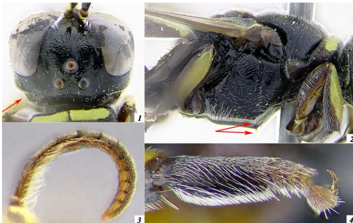
Figs 1–4. Male of Crossocerus strangulatus (Bischoff, 1930): 1 — head, dorsal view; 2 — mesosoma, lateral view; 3 — antenna; 4 — foretarsus. Рис. 1–4. Самец Crossocerus strangulatus (Bischoff, 1930): 1 — голова, вид сверху; 2 — мезосома, вид сбоку; 3 — антенна; 4 — передняя лапка.