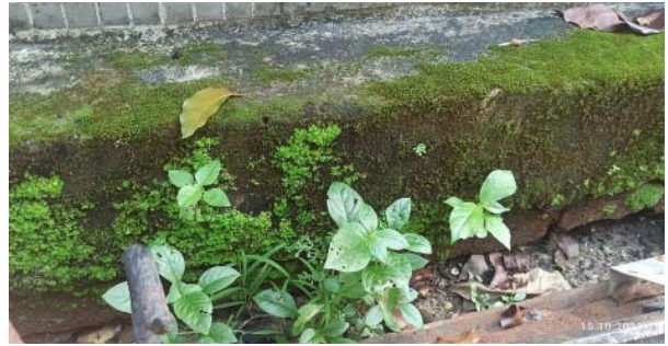
Fig. 7. Habitat of C. kimi , sp.n. Рис. 7. Место обитания C. kimi , sp.n.