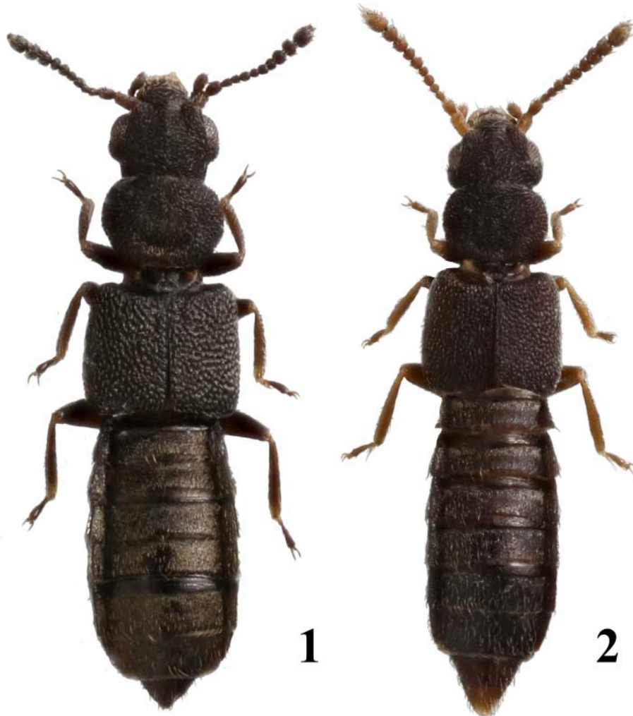
Figs 1–2. Carpelimus spp.: 1 — Carpelimus (Bucephalinus) kimi sp.n. , holotype, male, dorsal view; 2 — Carpelimus (Bucephalinus) pseudonepalicus Gildenkov, 2013, paratype, male, dorsal view.

Pronotum maximum broad after about 2/3 its length from base, then narrowed. Lateral margins smoothly rounded (Fig. 1). Ratio of pronotum length to its maximum width about 16:20. Surface of pronotum evenly shagreened, like head surface. Pronotal disc with well-developed crescent-shaped depression at the base (Fig. 1).