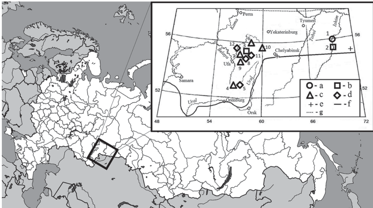
Fig. 1. Holocene localities with marten remains. Legend: a — AT, b — SB, c — SA1, d — SA2, e — data on sable hunting in the XVII–XVIII centuries (Kirikov, 1959), f — southern border of modern distribution of the pine marten, g — southern border of modern distribution of the sable. 1 — Mergen 6, 2 — Balandino, 3 — Yukalikulevo, 4 — Tashmurun (SA1), 5 — Tashmurun (SA2), 6 — Serny kluch, 7 — Podpornaya, 8 — Kalinovskaya, 9 — Atysh, 10 — Berezki Vv, 11 — Staroe logovo, 12 — Barsuchy Dol.

the past (Kosintsev & Gasilin, 2011; Gasilin et al. , 2013). The same is observed in the present time (Heptner et al. , 1967; Nasimovich, 1973). Correct species identification becomes essential for those closely related species which ranges are sympatric. The postcranial skeletal elements of marten species are morphologically similar which makes their species identification rather difficult (Ambros & Hilpert, 2005). Diagnostic features of the skull are often used for species identification (Altuna, 1973; Smirnov, 1975; Gerasimov, 1985; Aristov & Baryshnikov, 2001; Loy et al. , 2004; Monakhov, 2008, 2012; Ranyuk & Monakhov, 2011, 2015), but in fossil material complete skulls are rare and bone fragments and isolated teeth are more common. Tooth morphotypes and their variability also can be used for discrimination between marten species (Miller, 1912; Ognev, 1931; Pavlinin, 1963; Wolsan et al. , 1985, 1989; Gasilin & Kosintsev, 2013; Gimranov & Kosintsev, 2015).