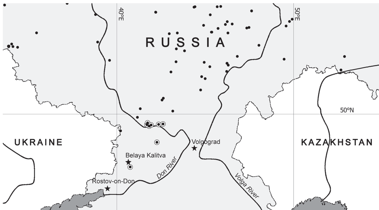
Fig. 1. Map of the distribution of the bank vole in southern European Russia (black dots) and geographical position of studied material (black dots in white circles).