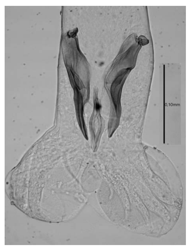
Fig. 6. Trichostrongylus capricola, posterior end of male.