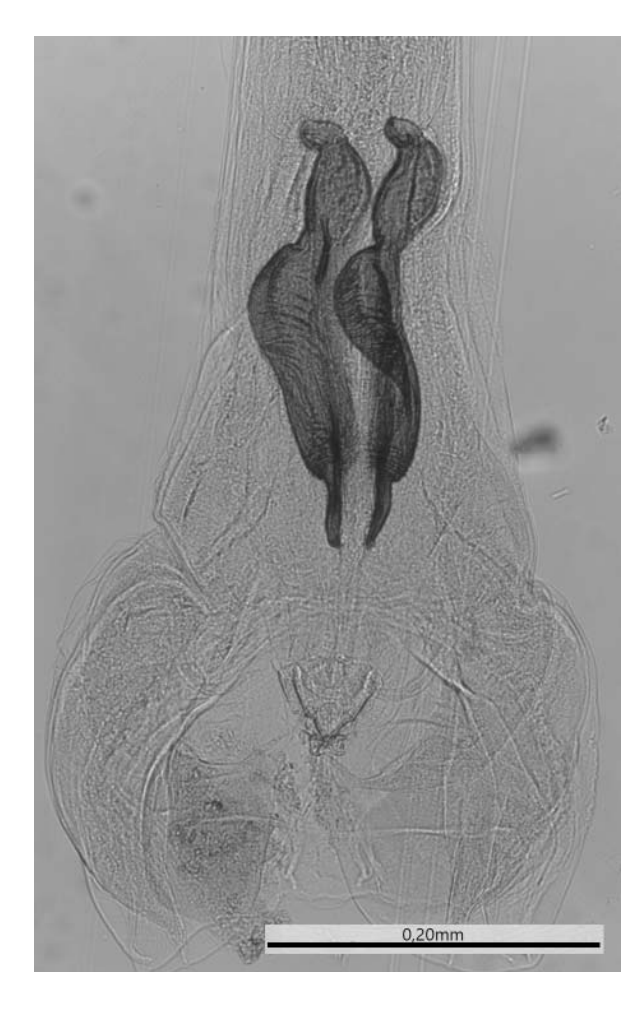
Fig. 2. Cooperia pectinata, posterior end of male.

piewska et al. (2018) report detection of this nematode in common fallow deer in Poland, Germany, Austria, Italy, Spain and the United Kingdom. Based on their own data, Wyrobisz-Papiewska et al. (2018) also report the detection of S. asymmetrica in European roe deer (Capreolus capreolus (Linnaeus, 1758)) in Poland, but with much lower rates of prevalence and intensity of infection, than in fallow deer. It is worth mentioning that mean intensity of infection with S. asymmetrica in fallow deer (25 specimens), noted by Wyrobisz-Papiewska et al. (2018), is close to those registered by us. Beside this, Govorka et al. (1988) mention fallow deer as the host of S. asymmetrica in Czechoslovakia. In Slovenia, Vengust & Bidovec (2003) found S. asymmetrica in 63% of necropsied fallow deer. In Sweden, S. asymmetrica was detected in fallow deer with 67% prevalence (Halvarsson et al., 2022). Doster & Friend (1971) reported S. asymmetrica from D. dama in USA. In Australia, S. asymmetrica was found in 75% of studied fallow deer (Mylrea et al., 1991). In Russia, S. asymmetrica recently was reported from C. capreolus and Alces alces Linnaeus, 1758 (Kuznetsov, 2013; Kuznetsov et al., 2020, 2022).