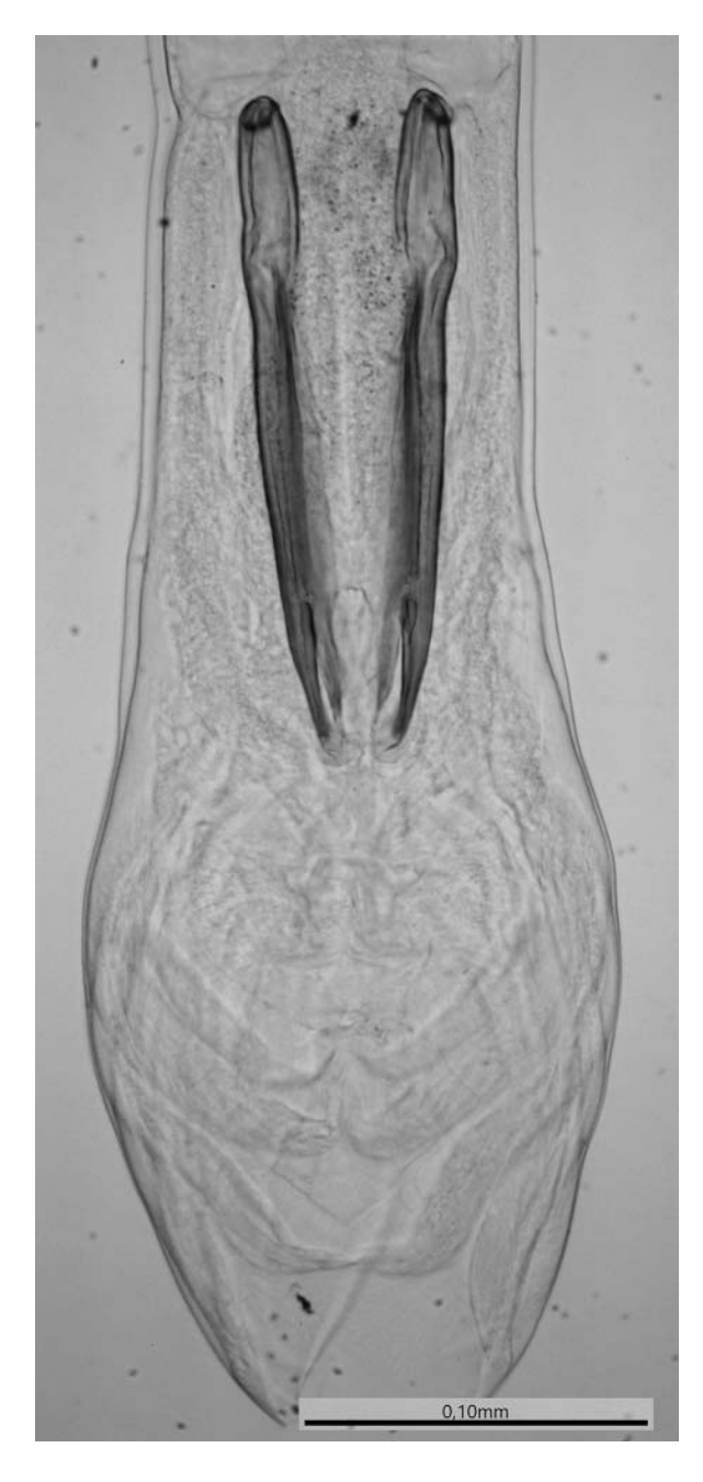
Fig. 4. Ostertagia leptospicularis, posterior end of male.