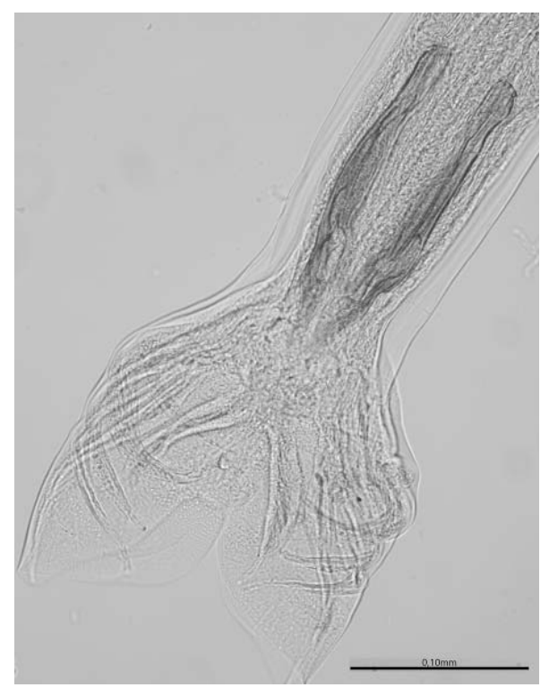
Fig. 5. Spiculopteragia asymmetrica, posterior end of male.