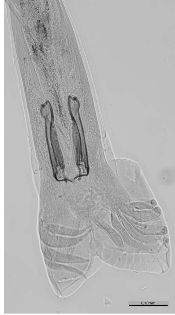
Fig. 3. Mazamastrongylus dagestanica, posterior end of male.

piewska et al. (2018) report detection of this nematode in common fallow deer in Poland, Germany, Austria, Italy, Spain and the United Kingdom. Based on their own data, Wyrobisz-Papiewska et al. (2018) also report the detection of S. asymmetrica in European roe deer (Capreolus capreolus (Linnaeus, 1758)) in Poland, but with much lower rates of prevalence and intensity of infection, than in fallow deer. It is worth mentioning that mean intensity of infection with S. asymmetrica in fallow deer (25 specimens), noted by Wyrobisz-Papiewska et al. (2018), is close to those registered by us. Beside this, Govorka et al. (1988) mention fallow deer as the host of S. asymmetrica in Czechoslovakia. In Slovenia, Vengust & Bidovec (2003) found S. asymmetrica in 63% of necropsied fallow deer. In Sweden, S. asymmetrica was detected in fallow deer with 67% prevalence (Halvarsson et al., 2022). Doster & Friend (1971) reported S. asymmetrica from D. dama in USA. In Australia, S. asymmetrica was found in 75% of studied fallow deer (Mylrea et al., 1991). In Russia, S. asymmetrica recently was reported from C. capreolus and Alces alces Linnaeus, 1758 (Kuznetsov, 2013; Kuznetsov et al., 2020, 2022).