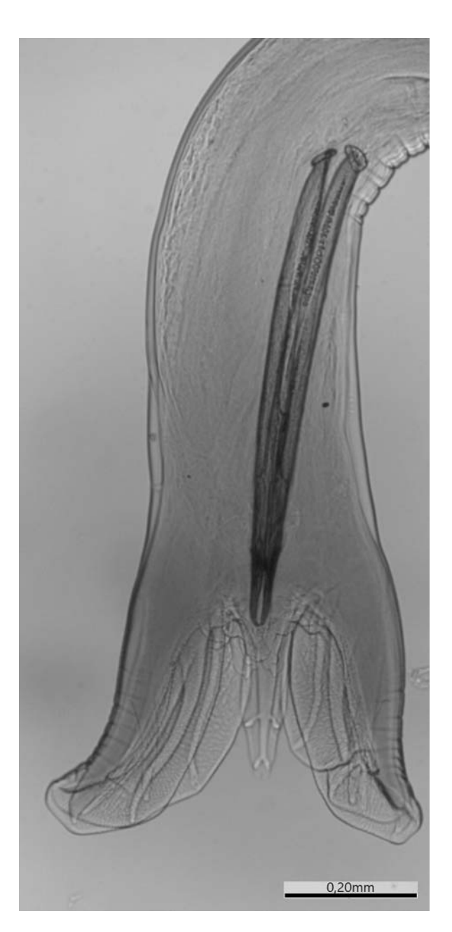
Fig. 1. Ashworthius sidemi, posterior end of male.

Spiculopteragia asymmetrica was most often found in the studied common fallow deer (Tab. 2). This species also showed the highest intensity of infection in the present study (Tab. 1). These observations agree with Wyrobisz-Papiewska et al. (2018), who consider D. dama to be the principal host of S. asymmetrica. Based on bibliographical references, Wyrobisz-Pa-