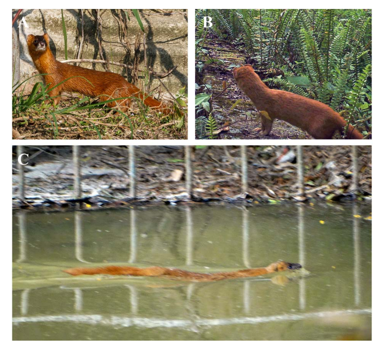
Fig. 3. Siberian weasel Mustela sibirica from Hong Kong. (A) Long Valley, 1 July 2010, (B) Kadoorie Farm and Botanic Garden, 4 April 2012, (C) Tsung Yuen Ha, 22 February 2014