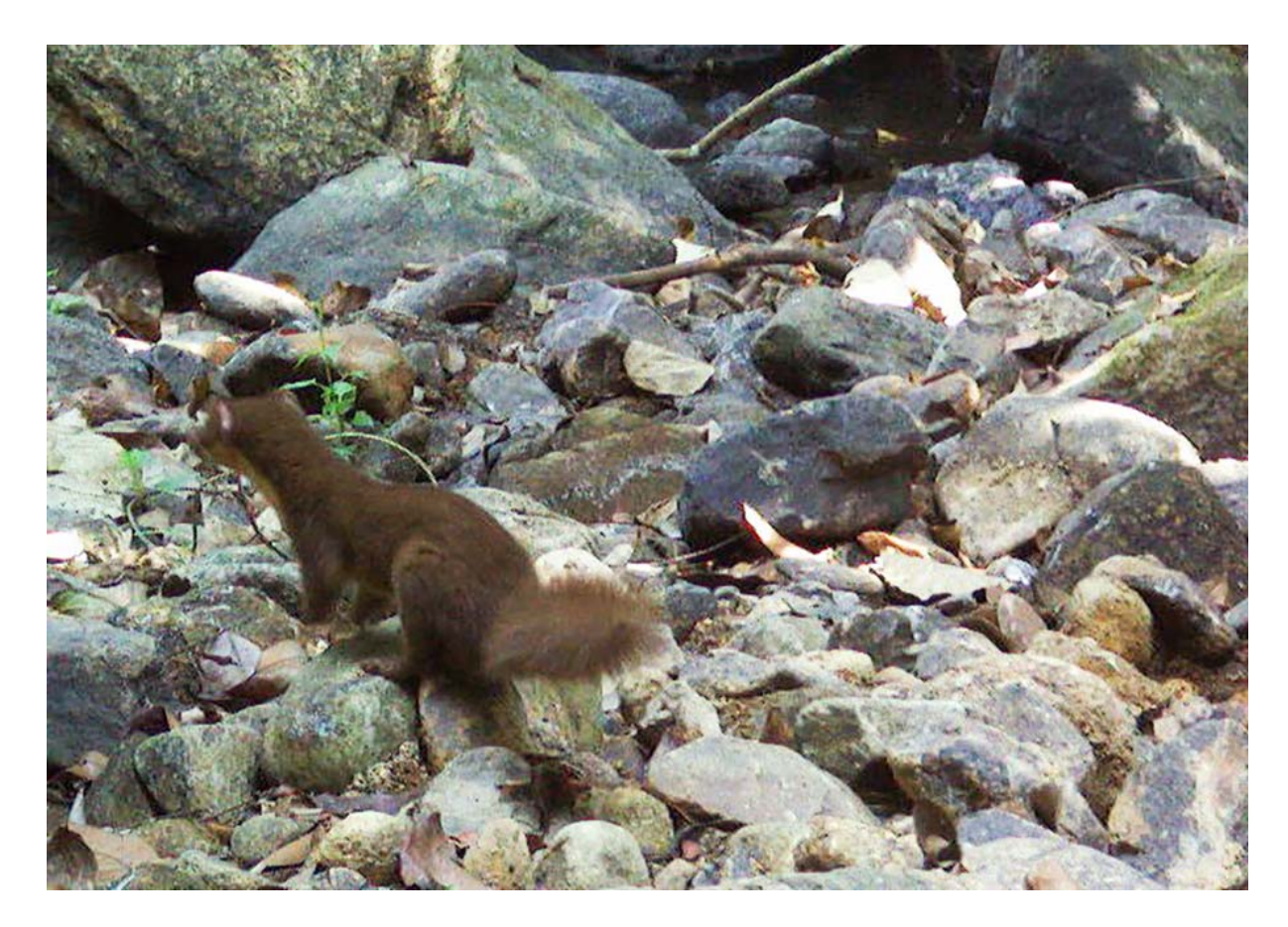
Fig. 2. Yellow-bellied weasel Mustela kathiah camera-trapped at Lai Chi Wo, northeastern Hong Kong, 20 February 2020, photo: Kadoorie Farm and Botanic Garden.

mal was camera-trapped at Kadoorie Farm and Botanic Garden on 4 April 2012 at 08h38 (Fig. 3B), in a steep valley with closed-canopy secondary forest at 450 m asl. Although the photo only captured the dorsum of the animal, it shows characters typical of M. sibirica ; small carnivore experts A.V. Abramov and J.W. Duckworth were consulted and both concurred with the identification. It is noteworthy this site also yielded a record of M. kathiah . On 22 February 2014, the third Hong Kong record was made at the rural Tsung Yuen Ha area (ca. 10 m asl) of northeastern Hong Kong adjoining the Shenzhen border (Fig. 3C). The weasel was photographed at 15h18 swimming in a waterway flowing pass abandoned farmland.